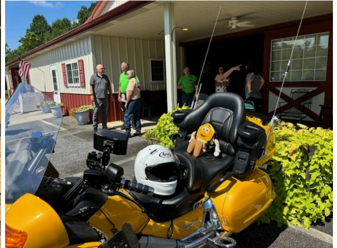
The group and M2 presenting a check for $1,700 to J Iverson Riddle Development Center.

As a closing note, the holiday season is just around the corner and cooler weather, get out and ride and hope to see some of you more often. The "Hump Day" rides are getting busier with some of our seasonal people returning from their summer homes and looking forward to seeing some returning faces and shaking their hands!!!