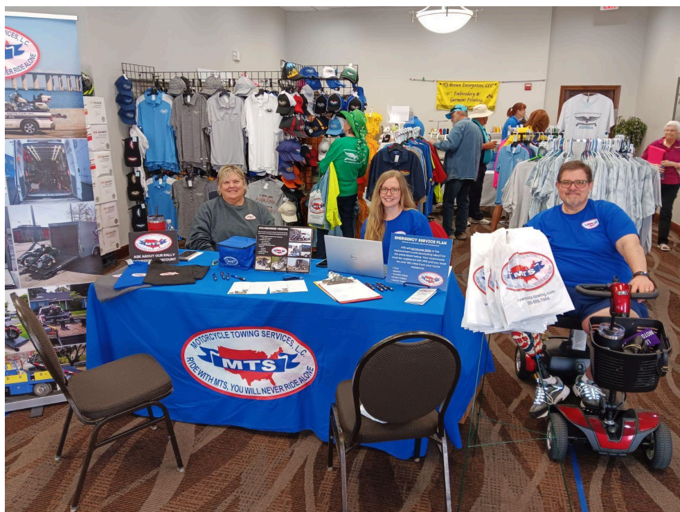
MTS reps at FL

State Rally 2024 They will be supporting our chapter with giveaways!!!