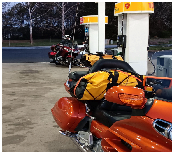
Cold start from Carolinas, Florida bound.