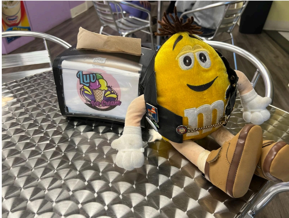
M2 made a surprise visit!