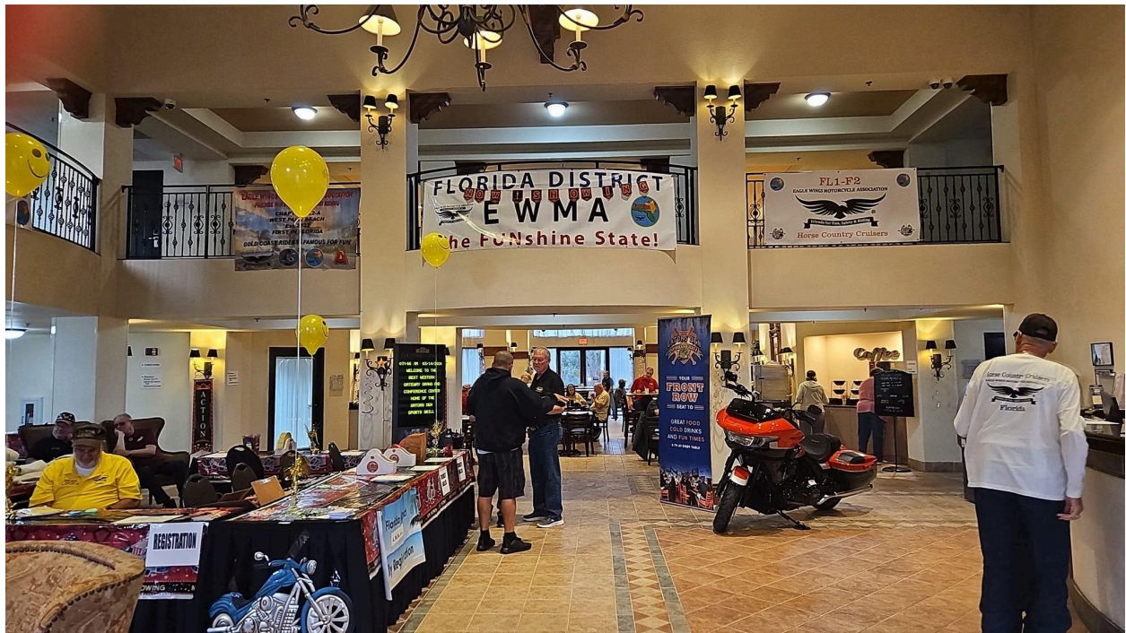
FL State Rally lobby 2024