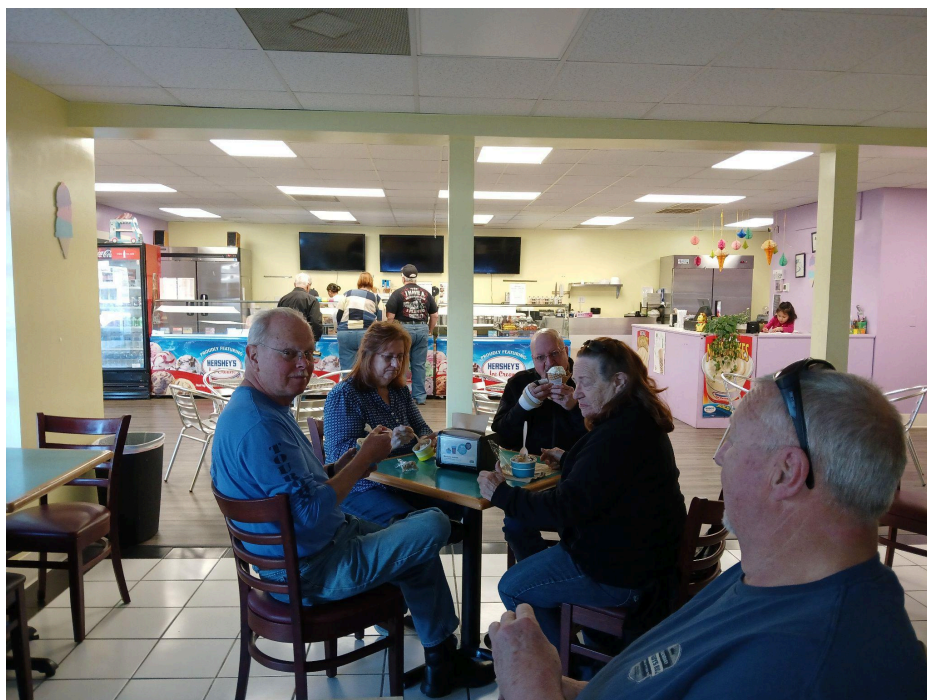
Thanks to all that came to the Ice Cream Ride. We rode through Mills River, up 280 by Butler Bridge Road, and into the Luv's Ice Cream parking lot. 15 ice cream lovers came together for a good time of fun & fellowship.