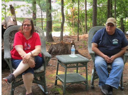
Cookout in Saluda!