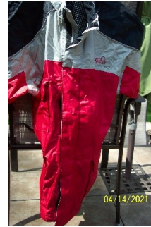
Tour Master Rain Jacket Red/Grey/Black Men's Medium $20.00