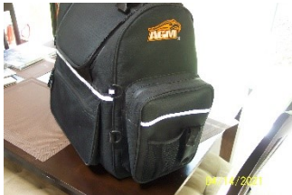
AGM Supplement Travel Bay From Poland $75.00