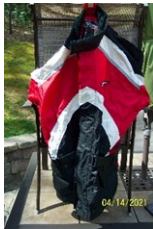
Teknic Rain Suit Jacket & Pants Red/White/Black Woman's Medium $30.00