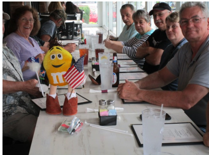
Cook's Nite Out at Apollo Flame!