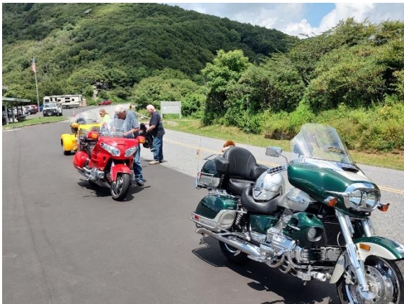
Hump Day on the Parkway

The BMW factory tour is set for 08/09/23 (Hump Day ride). For this hump day we will not be meeting at Eggs Up Grill. Our tour is at 9:45am and we need to be there at 9:15am per their instructions. The ride there will take about 1 hour. We will be meeting at Ingles on Spartanburg Highway and Upward Rd to go to this event. Kick stands up at 7:56am. This is also a pre-paid sign-up event. One of our members has paid for this but will not be able to make it. He is willing to let someone else go on his dime. If anyone is interested, please let me know as you must be listed on their roster and show ID upon arrival. I will have to work out the changes with them.