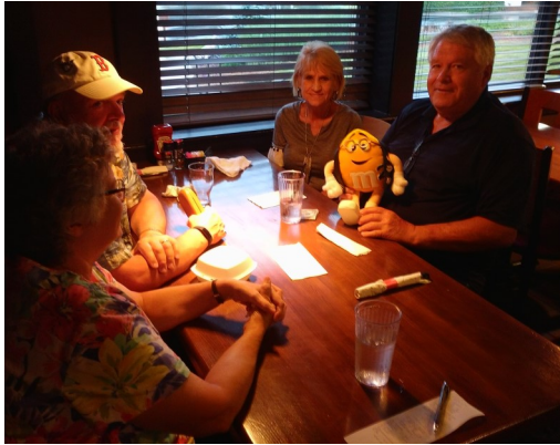
M2 joined us at Cook's Nite Out at TGI Friday's