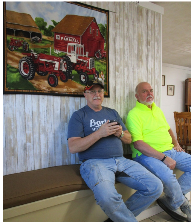
What are they cooking up now?????????