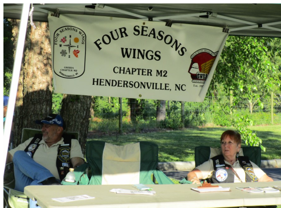
Selling raffle tickets & looking for new members at Bike Nite!