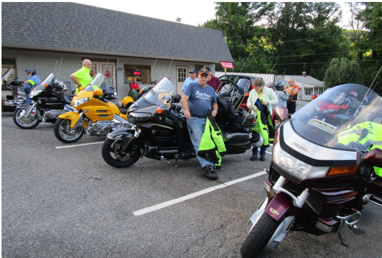
Ice Cream Barn in Columbus on a gorgeous evening! Plenty of room for parking & eating in their new location!

Contact Ken at: newlarz@yahoo.com if you can join us!