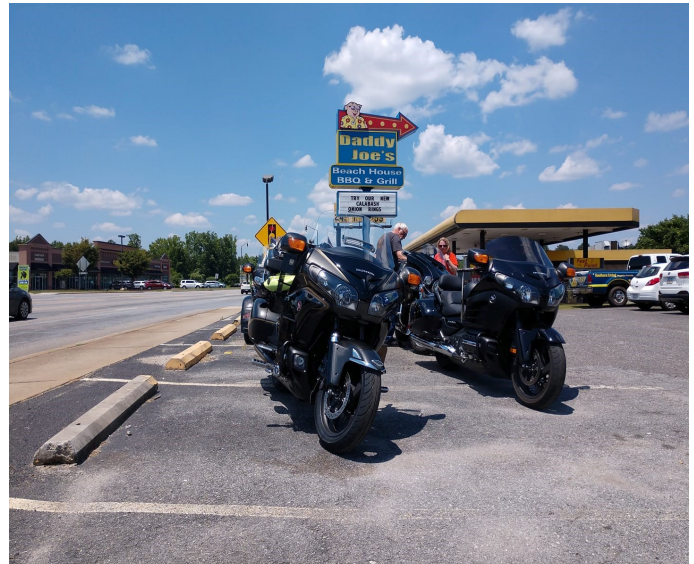
Hot ride to Daddy Joe's BBQ in Gaffney after the gathering