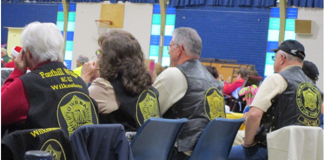
Chapter NC-M2 at J. Iverson Developmental Center Xmas Party