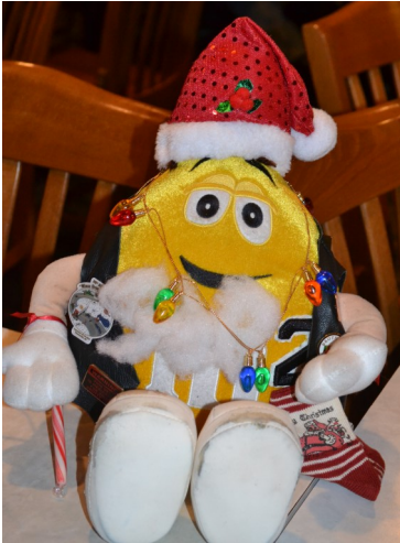
M2 was all decked out & ready to deliver presents!