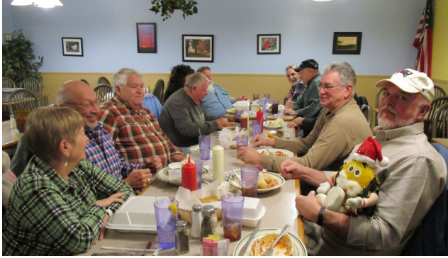
Cook's Nite Out