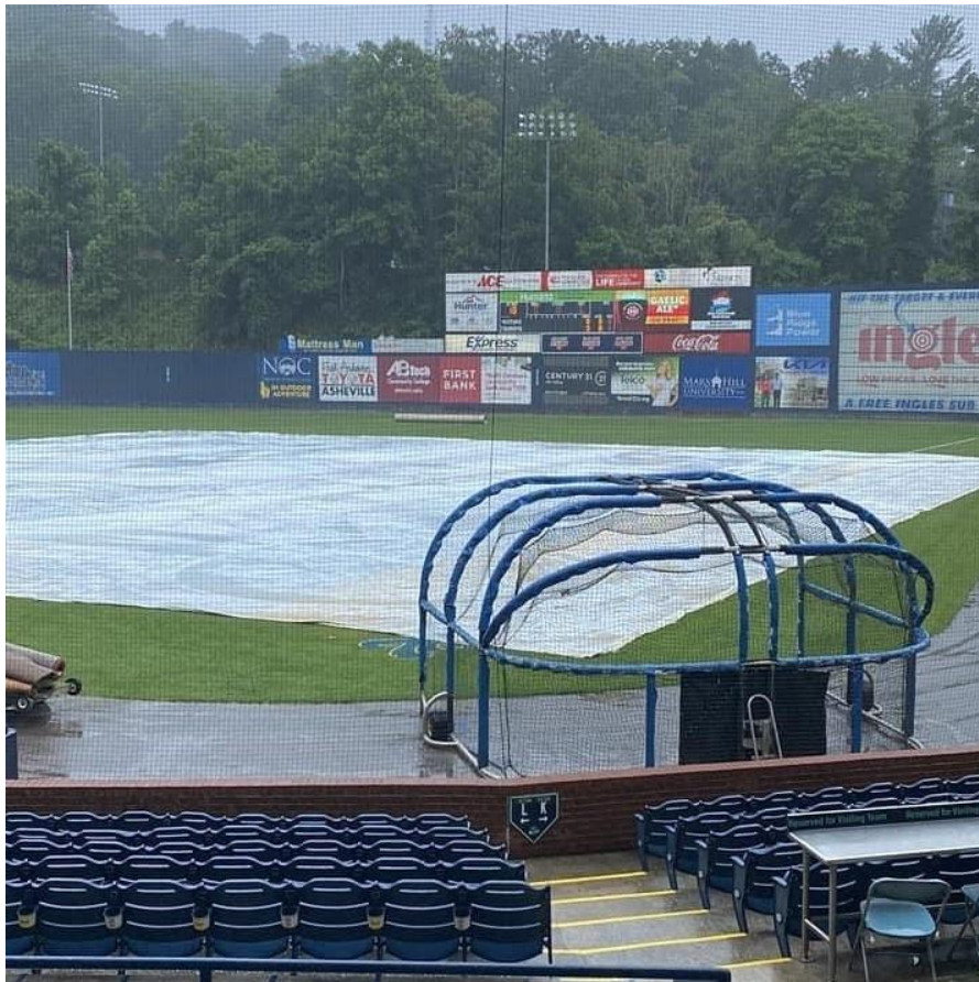
Rain-Out of the Asheville Tourists Game - Not a very Thirsty Thursday!