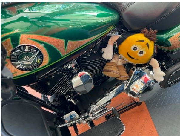
M2 Helping a Harley!