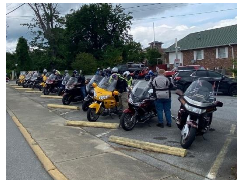
Chapter NC-M2 at American Legion Post #77