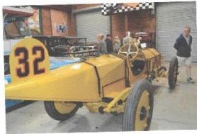
At the Cocker Museum