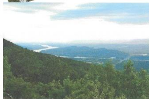
View from Our Porch!

The Alpine House, where we stayed, was an awesome 125-year-old home built in 1889. The first house was built in 1863 but destroyed by a fire and then rebuilt. After a filling dinner we sat on the front porch, had some liquid refreshment, admiring the spectacular view and watching the sun set.