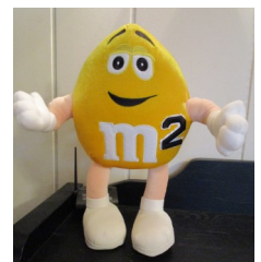
Come & meet our Mascot—M2