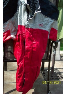
Tour Master Rain Jacket Red/Grey/Black Men's Medium $20.00