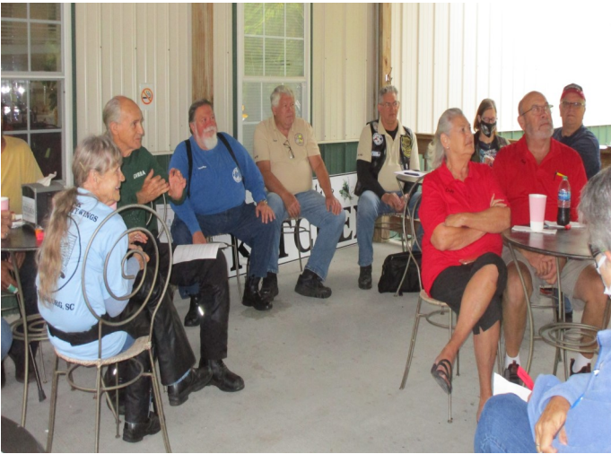
Good crowd at the gathering!