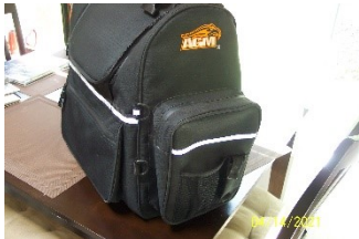
AGM Supplement Travel Bay From Poland $75.00