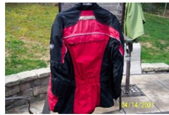
Winter First Gear Riding Coat Red/Black with Black Winter Pants Women's Medium $50.00