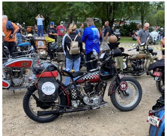
Cannonball Motorcycle Run at their overnight in Maggie Valley