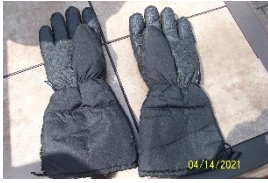
Winter Gloves with Gauntlets $10.00