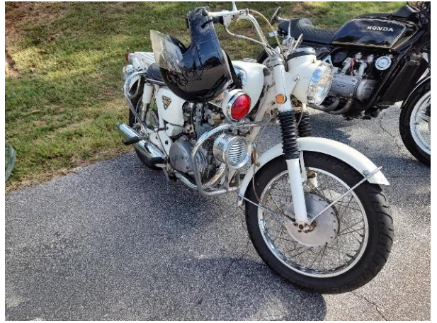
1969 Honda CB 450 P

The last weekend in September, I took 3 bikes to the G.A.S. Vintage motorcycle show in Piedmont, SC. Even though I didn't win anything there, I did get a lot of compliments on my bikes. It's nice to have them be seen by people. Nine of our Chapter members made the ride down to check out the show, as well. There were some rather rare bikes there like the 1969 Honda CB 450P. This was a police bike directly from Honda trying to get into the Police Departments by providing them with bikes but in the long run, Harley cornered the market.