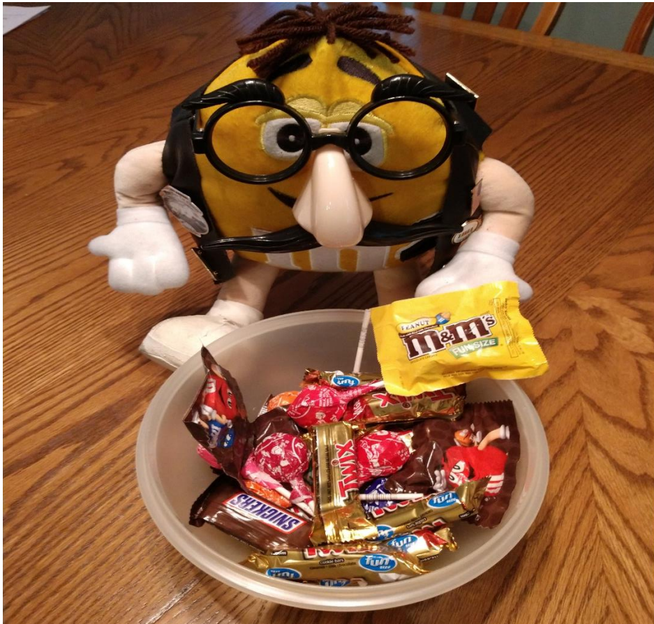
M2 Getting Ready for Halloween, Hanging with his Homies