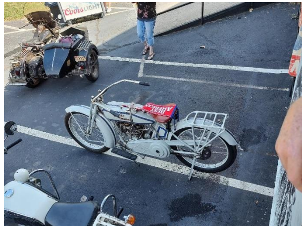
1916 Harley Davidson

Tech Tip: Yeah, it's time to do the seasonal switcharoo. All the cold weather gear you took out of the bike last spring will have to be gathered together, cleaned, if needed, and stashed back on the bike. I keep a sweatshirt on both of my main riding bikes, regardless of the season. Now is when you need to make sure you have your cold weather gloves or even a jacket liner, as well. It's a good time to evaluate what your bike needs since you probably spent more time riding it than caring for it. Right now we are going from cold mornings in the 40's, to afternoons in the 70's, so all types of gear will be needed.