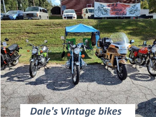
Dale's Vintage bikes

The next big event will be the bon fire being held at the Yager residence on November 5 th from 7:00pm until the fire burns out. This is not really a riding event but a casual get together to mark the end of the regular riding season. We typically bring some type of snack or dessert to pass around. We will have coffee on hand, as well as hot chocolate and some soda. If you prefer a particular drink, then you may want to bring it