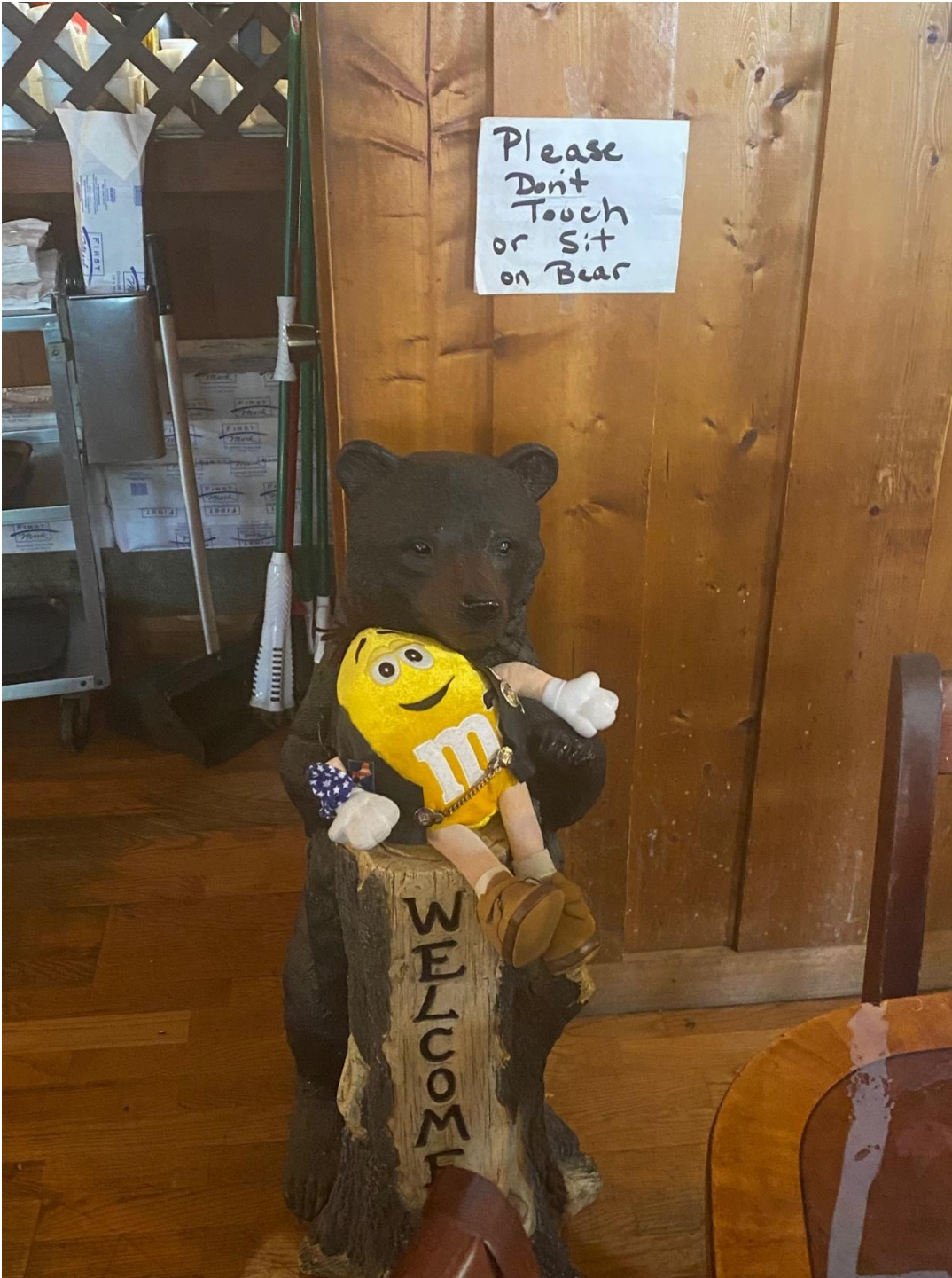
Hanging out with the Bears at Famous Louise's Rock House Restaurant in Linville Falls.