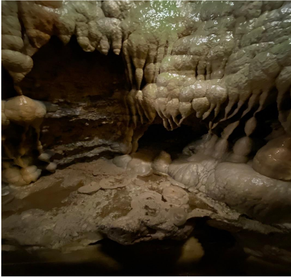
Inside the Linville Caverns - Looks a little scary, eh?