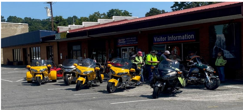
Mt. Mitchell Ride - Stop in Old Fort