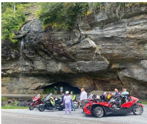
Bridal Veil Falls - Highlands, NC

We held our monthly Gathering at the Golden Corral, as usual, and had another great turnout with 19 members present! Lots of topics were discussed,