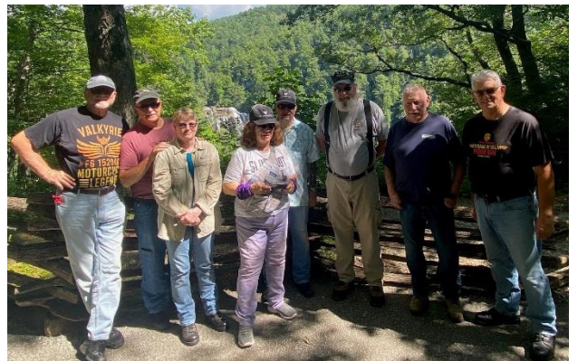
Our Group at Whitewater Falls - Cashiers, NC