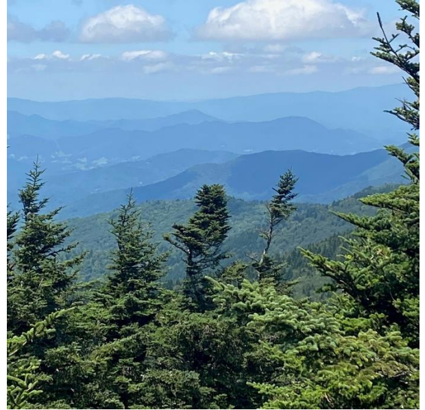
A real view from the Top, of Mt. Mitchell...that is.

After our meeting, we were led by Dale & Michelle, up to the top of Mt. Mitchell, via some very scenic and twisty backroads. Let's face it, you can't find too many straight roads along the mountains around here. Again, we had beautiful weather for riding and a picnic at the Craggy Gardens Picnic area, just a short ride along the Parkway from Mt. Mitchell. We even had a visit from a "Yogi" look alike, as I believe he was looking for picnic baskets! Fortunately, he stayed behind the bush line until we finished and then he came out looking for leftovers. This brings up a great reminder that you really need to be aware of the animal life around the area while riding. They can pop out anywhere and at any time, like we also saw along the Parkway after we left the picnic area.