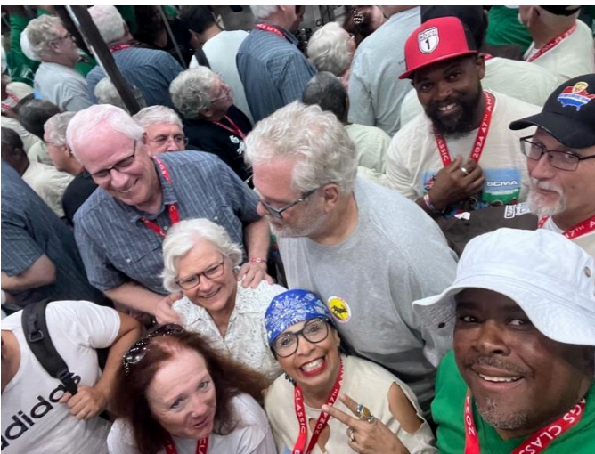
Stuck in a Tijuana elevator...