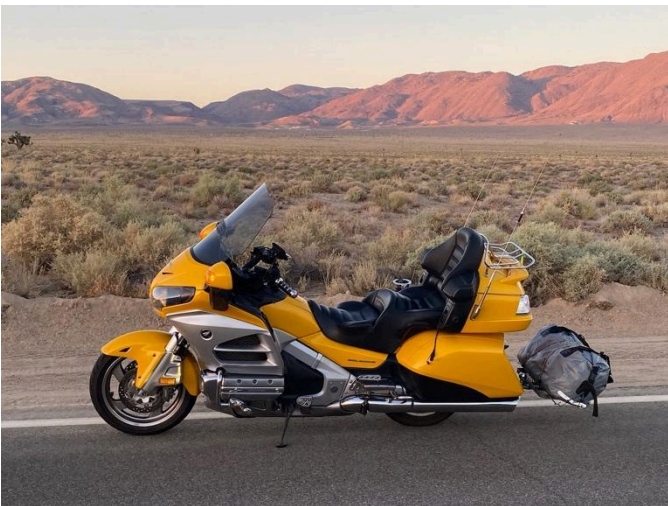
The Wing in Death Valley