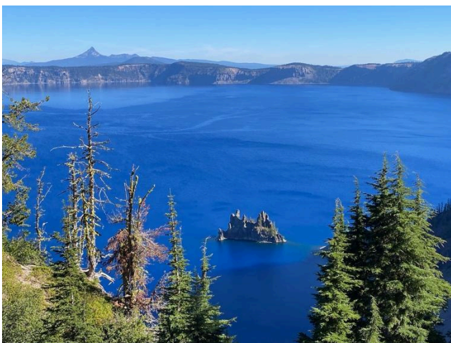
Crater Lake, OR

Get out and see this beautiful country of ours, meet new people, have new experiences, challenge yourselves.