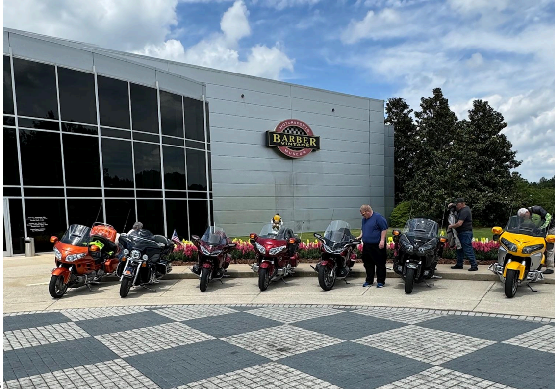
Alabama Trip Pics