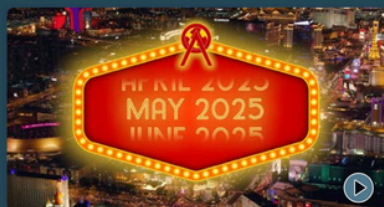
2025 AIL CONVENTION LOCATION: LAS VEGAS

Each year, American Income Life brings together its top people in places like Bahamas, Cancun, and Cabo at Convention. You can earn this all-expense paid trip for two by achieving personal and/or leadership minimums by the end of December.