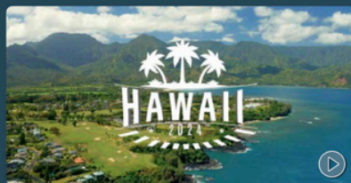
HAWAII IN MAY 2024! LOCATION: HAWAII