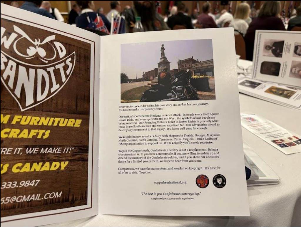
Copperheads' ad in the 2024 SC SCV Division Reunion packet

On Sunday, April 14th, the Low Country Crew Copperheads paid respects at the final resting place of Revolutionary War soldier, General Francis Marion. He is considered to be the father of modern guerilla warfare tactics.