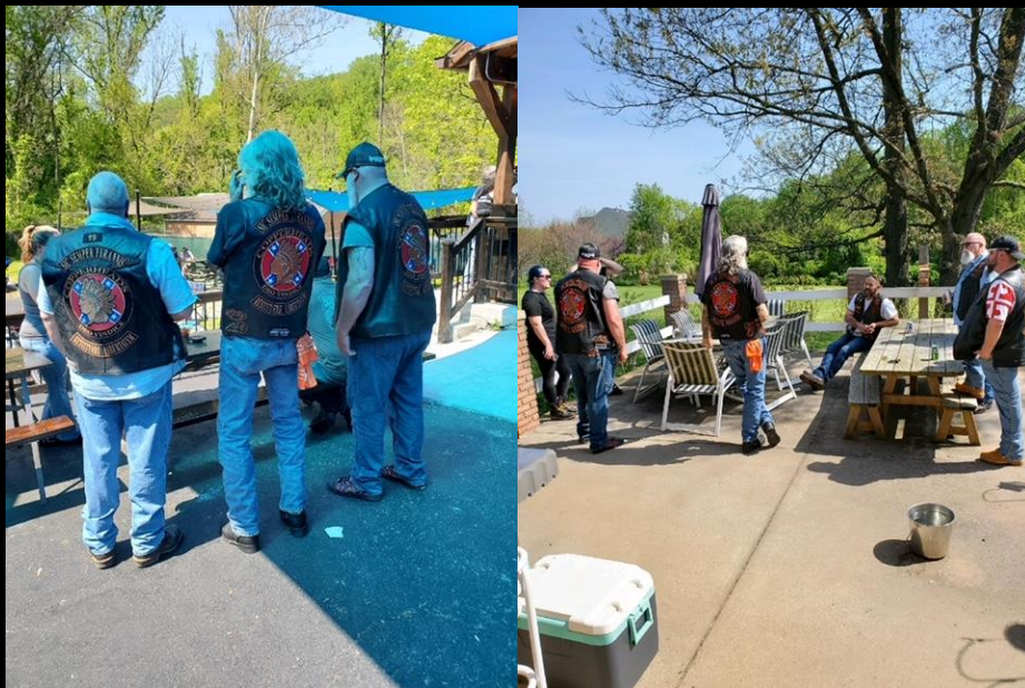
Virginia & West Virginia