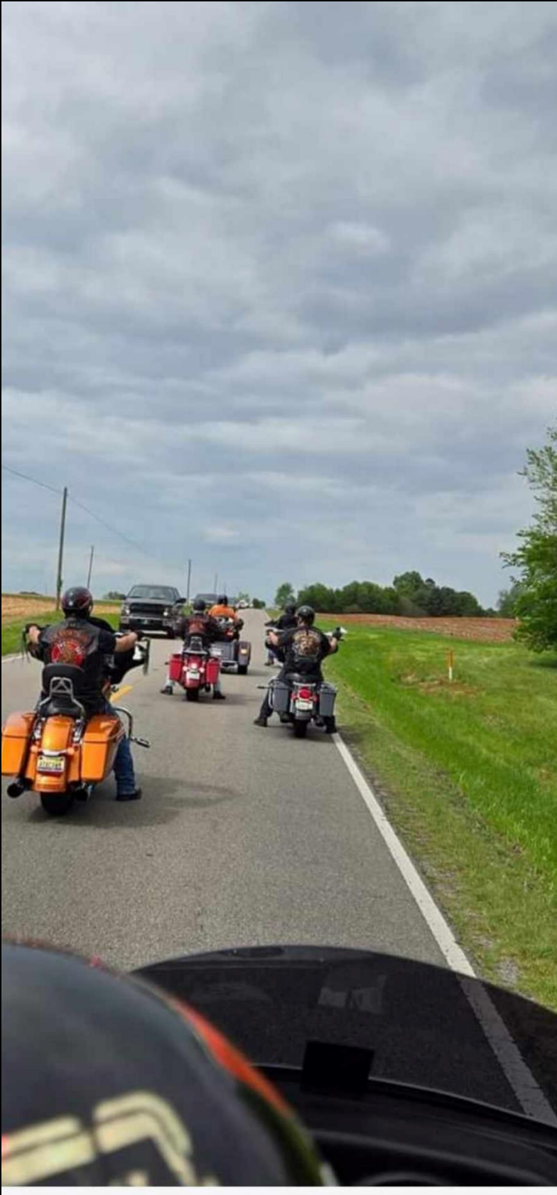
Alabama Copperheads representing heading to Elora Tennessee