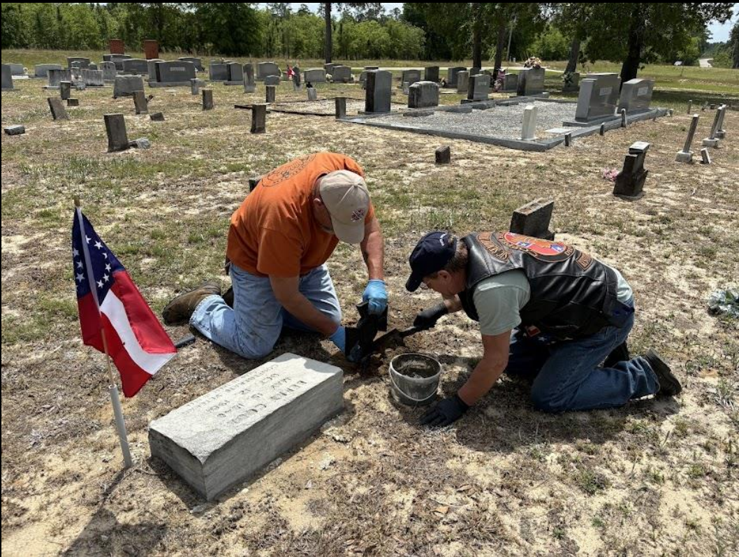
Placing one of four Southern Crosses of Honor