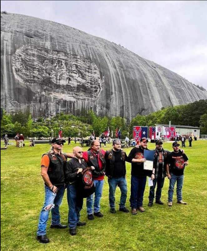
April 13th The Southern Platoon of the Georgia Copperheads sworn in Frog after fully completed his 90 days.