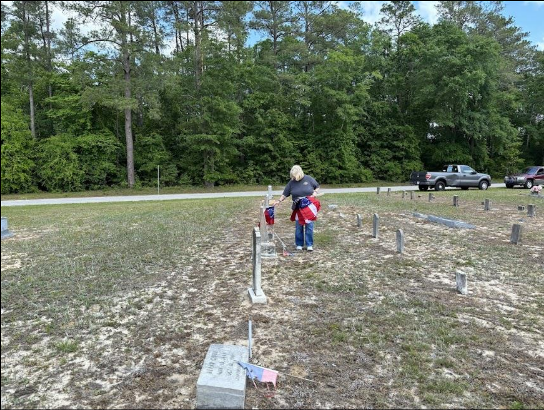
"Ladybug" places First Nationals at soldier's gra