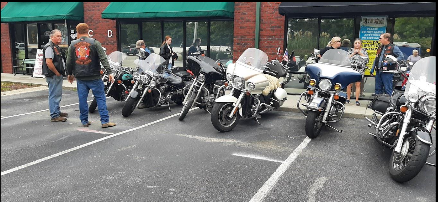
Low Country Crew Copperheads motorcycles parked in front of Help 4 Kids/Backpack Buddies

Money was generated via a raffle for a $500.00 Visa Card as well as individual contributions. Thank you to all those who sold and purchased tickets. This would not have been possible without your support. YOU are making a difference in someone's life.