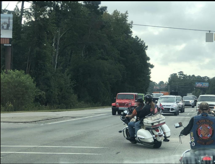
A young lady on her first of what will probably be many rides.