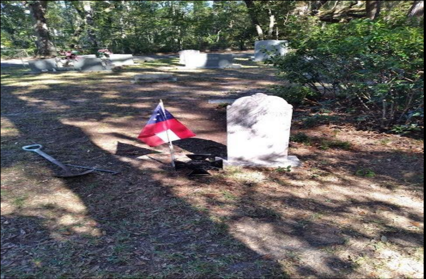
A new Southern Cross of Honor and First National flag were installed at a soldier's grave by 1st Sgt. Flanagan within 24 hours after being notified the previous cross had been broken.