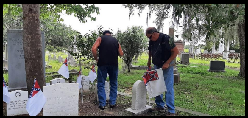
LCC makes the two-hour trip to Charleston, SC for the specific purpose of changing out flags at the crew's graves of the H. L. Hunley, several times a year.