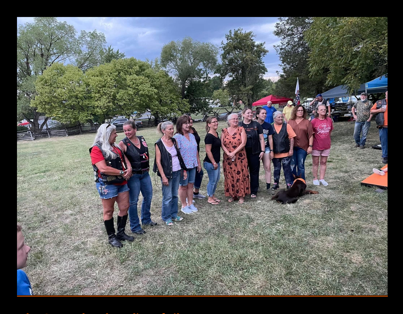
The Copperheads Ladies of Liberty