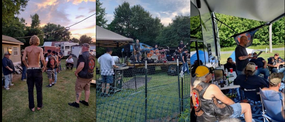
Virginia & West Virginia