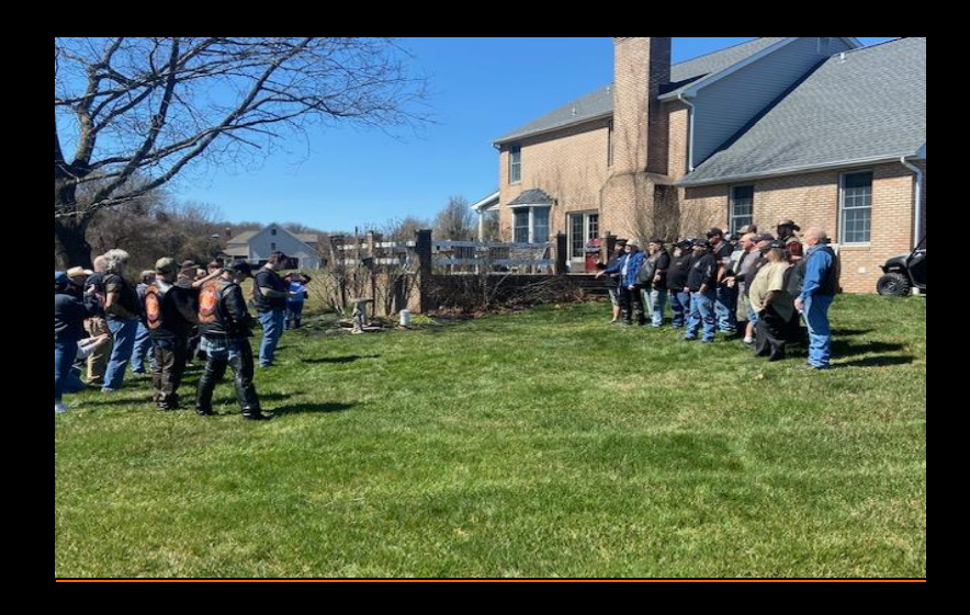
Swearing in March 2023 after 2-F disbanded