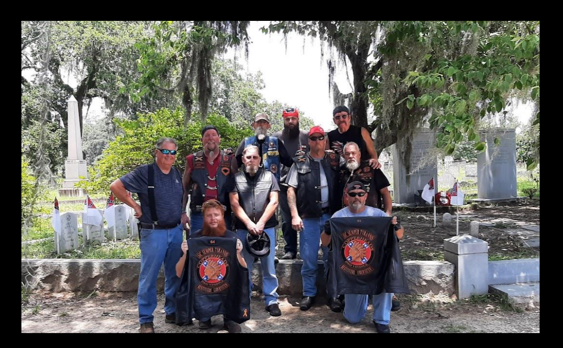
The Low Country Crew now members of the Copperheads