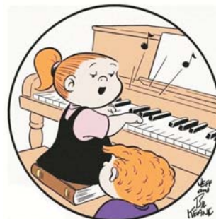
"Harmony is when you find two notes that love one another."

860 482-3234 email shoshanasam@yahoo.com