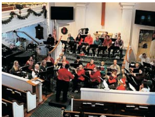
Farmington Valley Band Christmas Concert 12/6