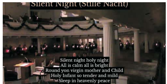
Christmas Eve Cqandlelight Service 12/24