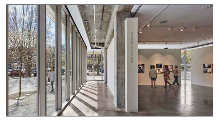
LUNDER ARTS CENTER-LESLEY UNIVERSITY

CAMBRIDGE, MA FIRM: BRUNER/COTT LEED GOLD