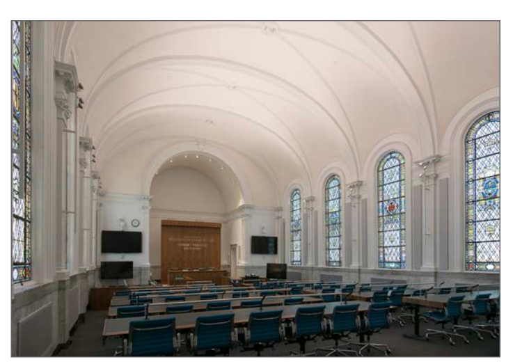
WASHINGTON COLLEGE OF LAW FIRM: SMITH GROUP JJR

Cellulose fibers may be fully recovered and reused on site, leaving virtually no excess material to return to the waste stream.