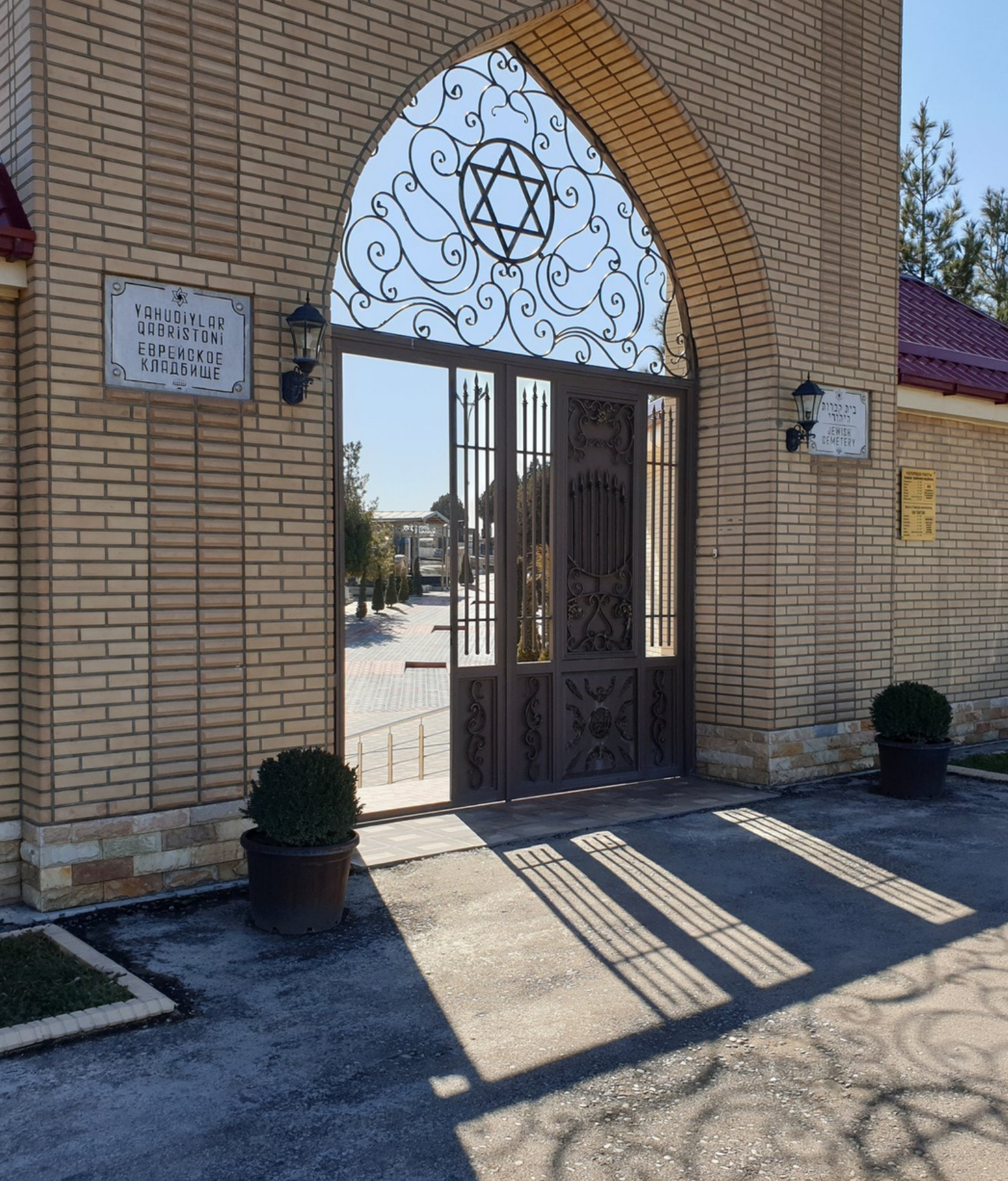
Jewish graveyard in Samarqand