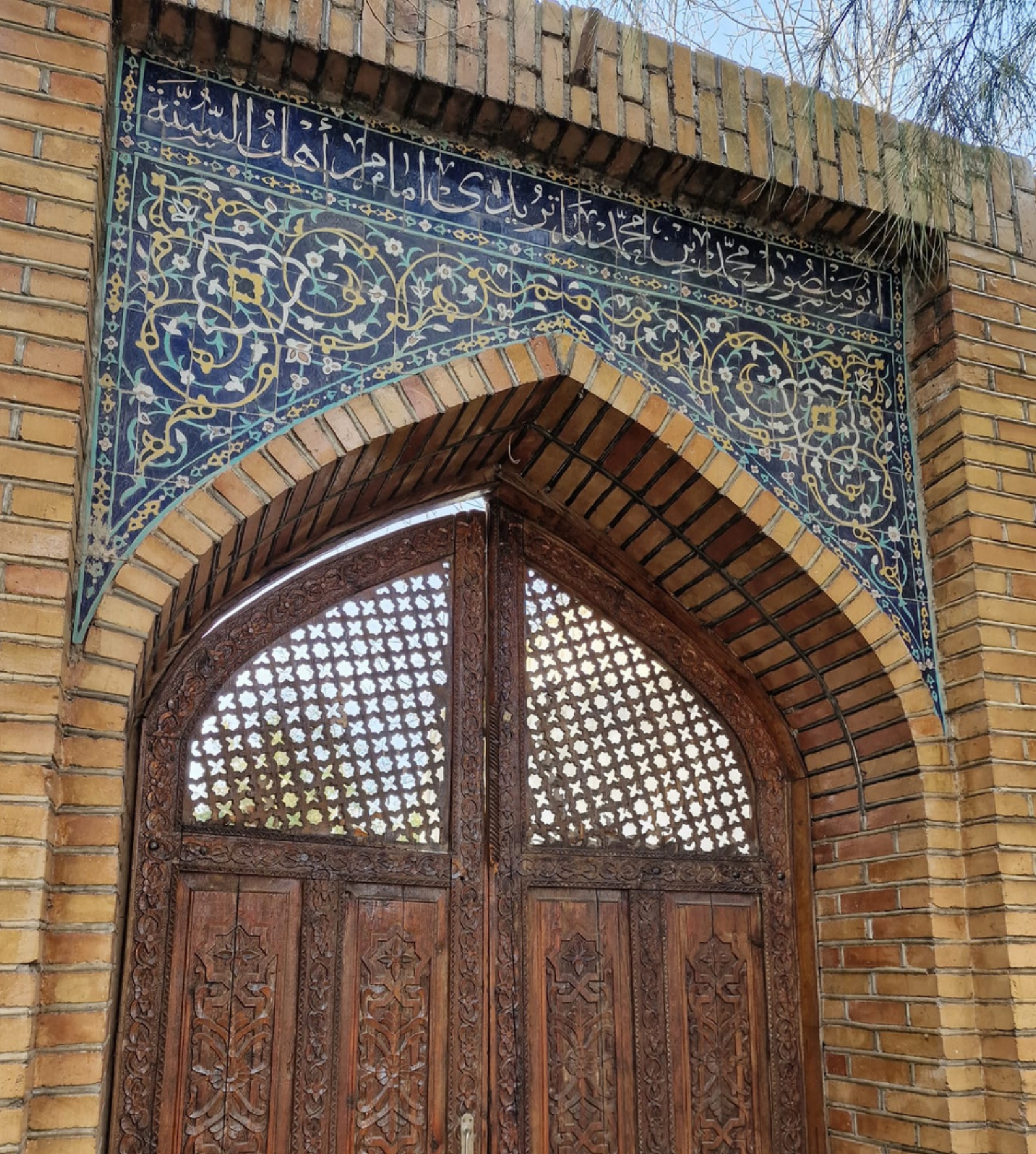
Complex of Imām Abū Mansūr Muḥammad ibn Muḥammad ibn Maḥmūd al-Māturīdī (RH)