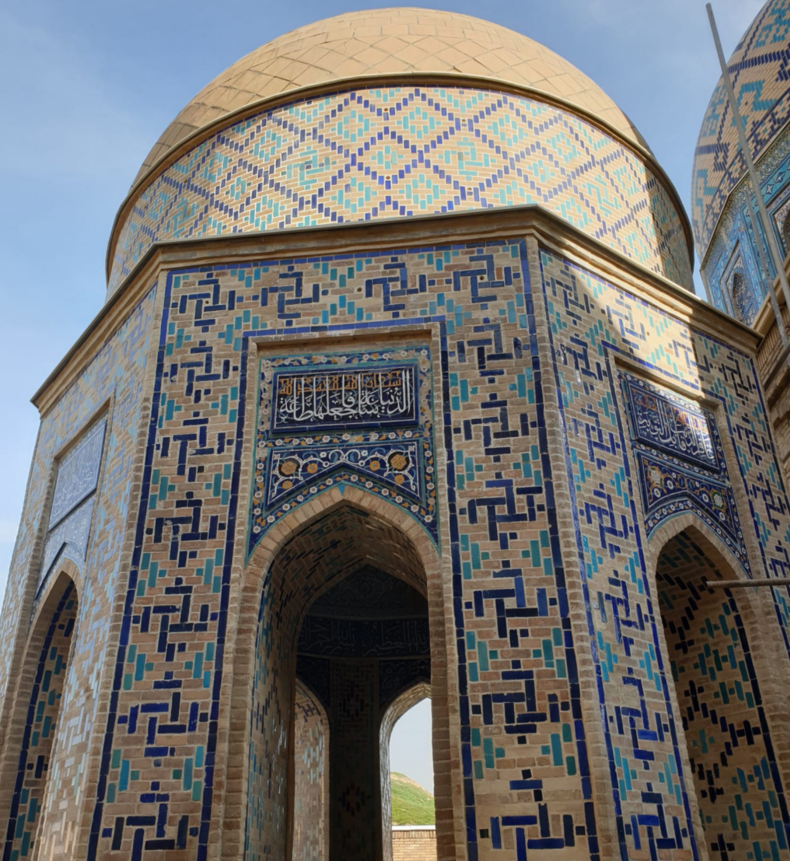
Shāh-i-Zinda & the grave of Qutham ibn al-Abbās رضي الله عنه