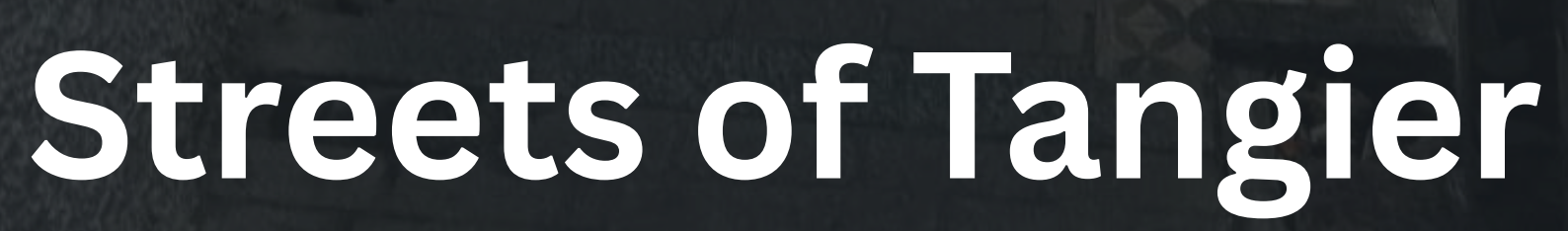
Streets of Tangier