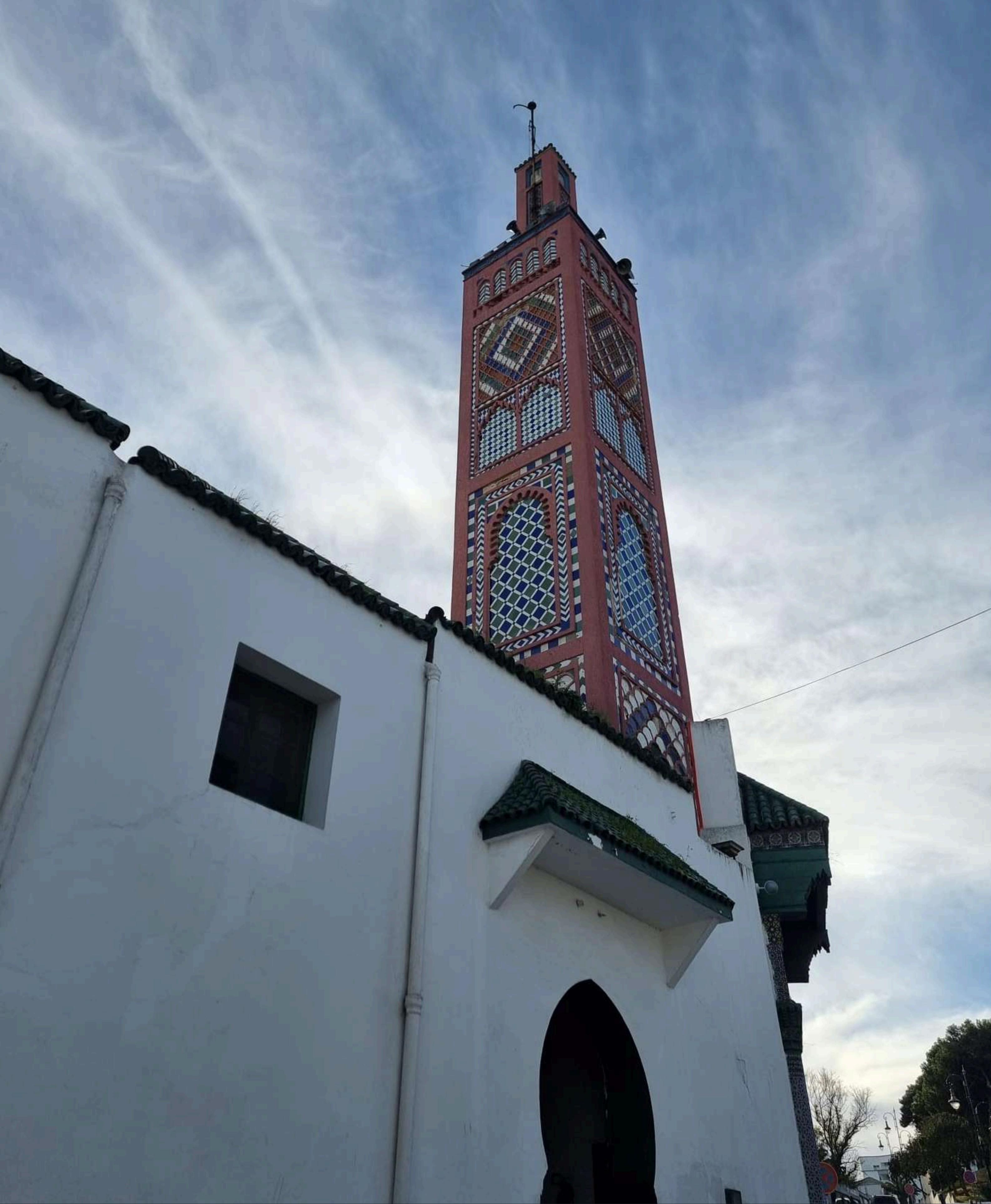
Masjid Sidi Bou abid located in front of the old market.