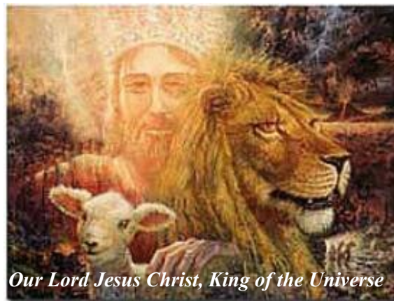
Our Lord Jesus Christ, King of the Universe

November 24 - 25, 2018 * Our Lord Jesus Christ, King of the Universe