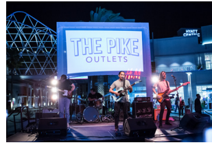
Summer Concert Series