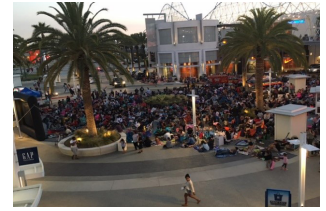
Summer Movie Series