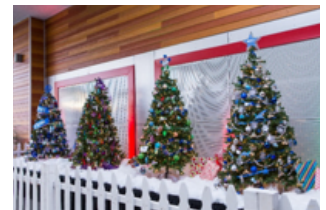
Festival of Trees

Easter Bunny Photos: Join us for free photos with the Easter Bunny! Free crafts and entertainment will be provided for the children while they wait for the pictures. Children can also receive an Easter egg with a special surprise to be claimed at one of our participating stores. Bring the whole family and make a day of it on March 31st!