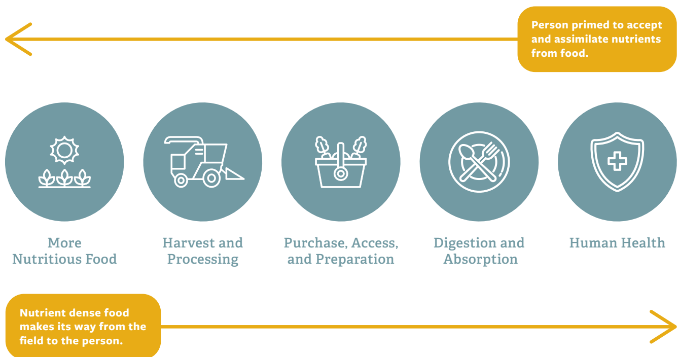
Figure 2: The pathway in which nutritious food travels from the field to the body while also acknowledging the body’s ability to assimilate and use those nutrients.

We have attempted to depict the journey from field to body as a way to organize and understand the Regenerative Agriculture → Human Health evidence (Figure 1). In this paper we will not delve into all of the evidence around which practices create more nutrient dense food as the principles and interventions to regenerate soils are well documented elsewhere. Instead, we focus first on the ultimate outcome: “human health”, then we go back to the beginning of the journey to discuss “more nutritious food,” and then some of the key milestones along the journey from the field to the body.