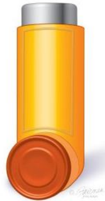
Proventil Albuterol Sulfate Inhaler