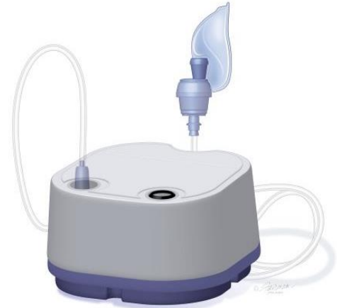
Accuneb Albuterol Sulfate Nebulizer

Albuterol is the most common rescue medicine for asthma. This is a short-acting medicine that should start to work within 10 to 15 minutes. Talk to your doctor about how often to use this medicine – it should not be used to prevent symptoms. It may be prescribed to be taken using either an inhaler or a nebulizer.