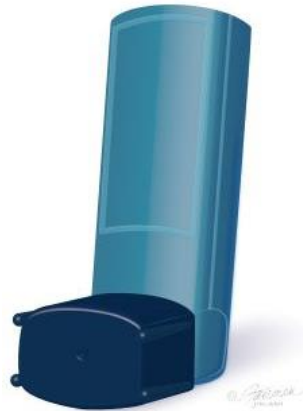
Ventolin Albuterol Sulfate Inhaler