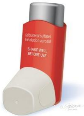
Pro-Air Albuterol Sulfate Inhaler