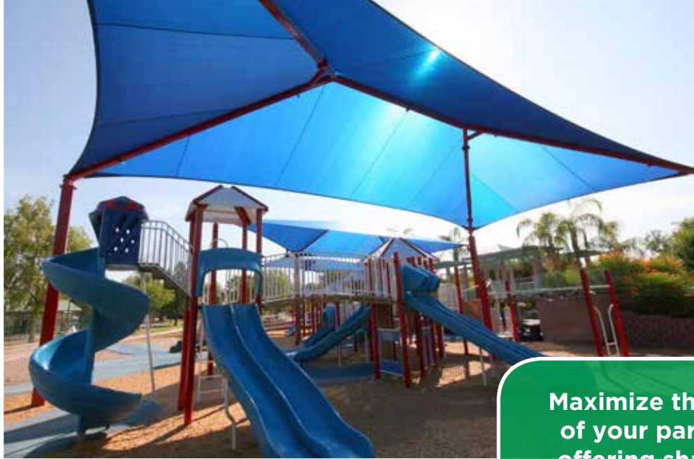
Maximize the use of your park by offering shaded seating areas.