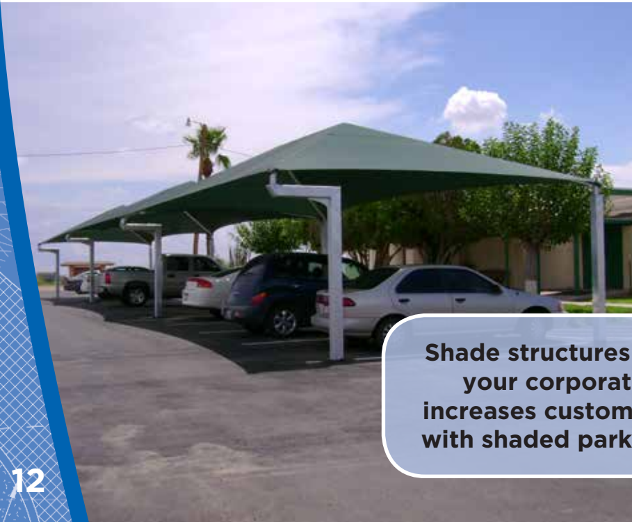
Shade structures to match your corporate logo increases customer appeal with shaded parking areas.