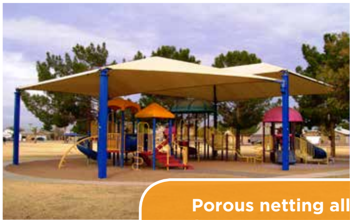
Porous netting allows hot air to escape - creates cool cushion underneath.