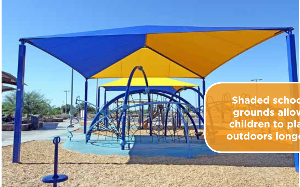
Shaded school grounds allow children to play outdoors longer.