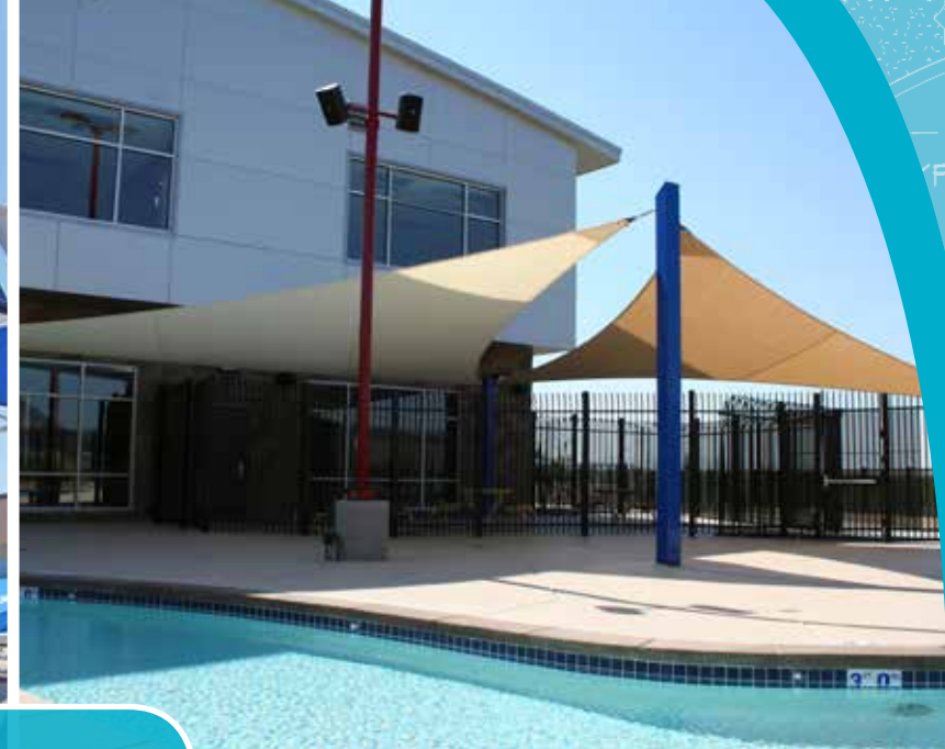
Shaded pool patio areas provide relief from the hot sun.