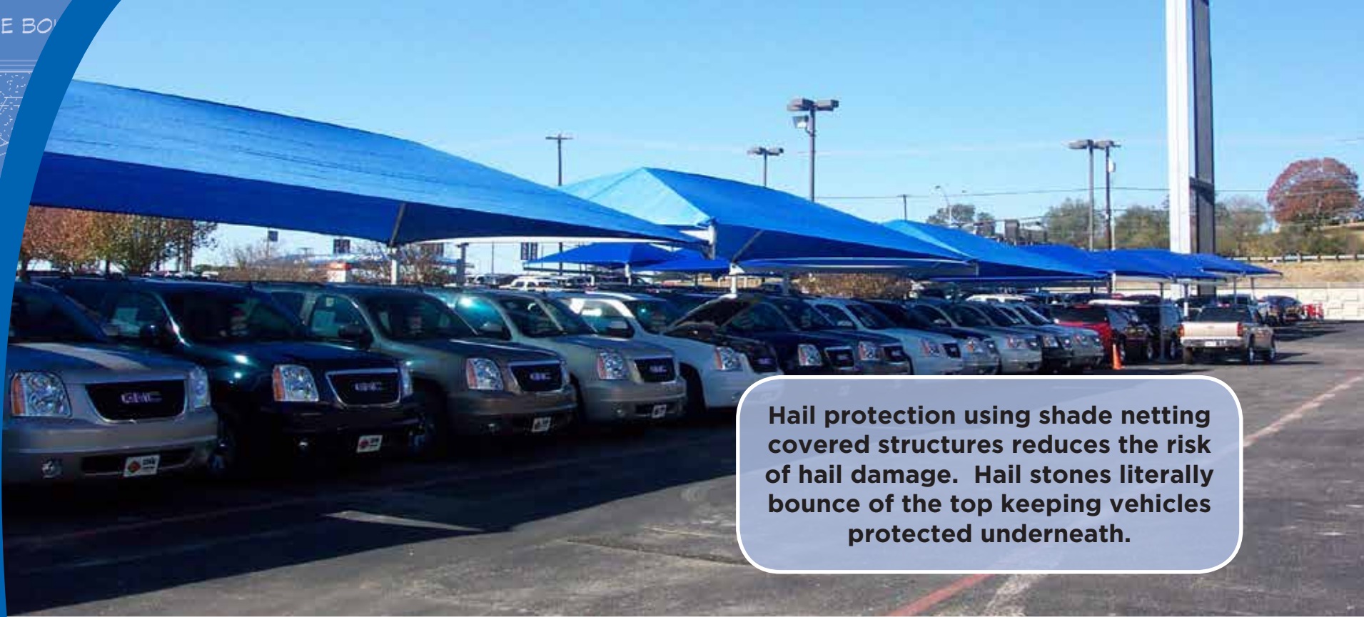
Hail protection using shade netting covered structures reduces the risk of hail damage. Hail stones literally bounce off the top keeping vehicles protected underneath.