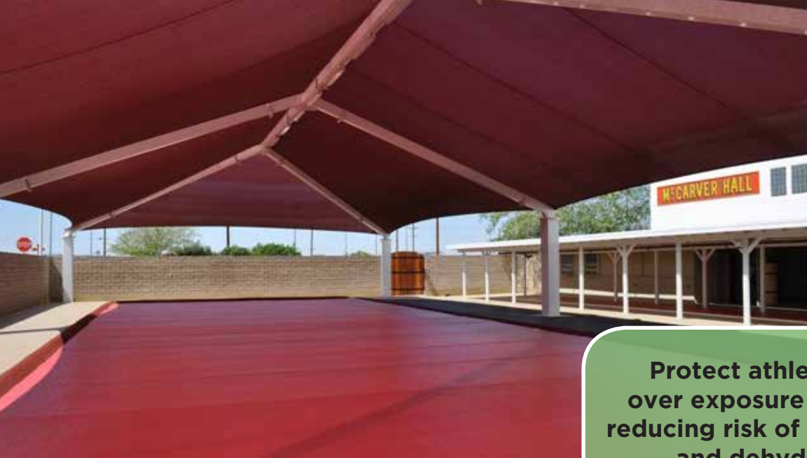
Protect athletes from over exposure to the sun reducing risk of heat fatigue and dehydration.