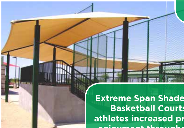
Extreme Span Shade for Outdoor Basketball Courts to allow athletes increased protection and enjoyment throughout the year.