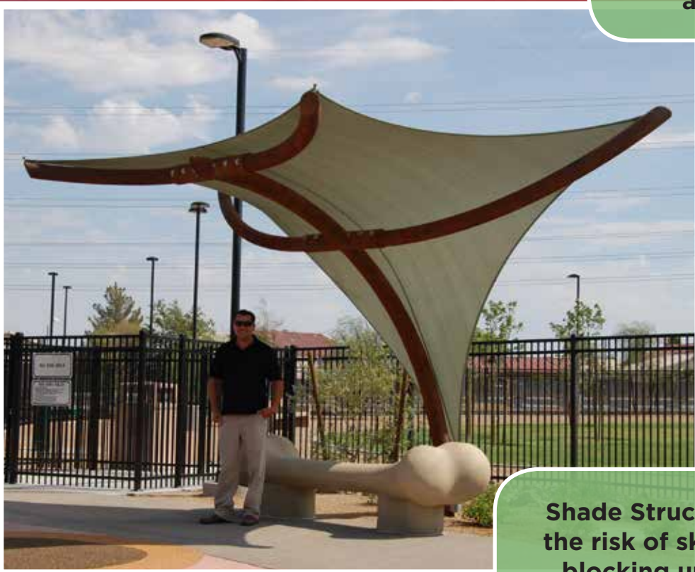
Shade Structures reduce the risk of skin cancer by blocking up to 97% of harmful UV rays of the sun.