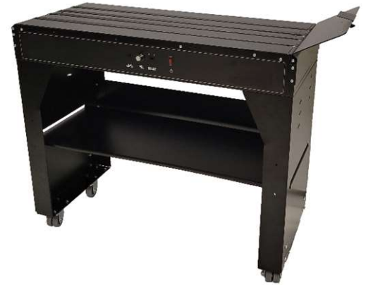
Conveyor With Stand (Stand sold separately)

Infinity Solutions product line continues to lead the industry with the C3600 Conveyor. Elevate your printing and paper operation efficiency with the C3600 – a 36” conveyor that can seamlessly integrate into your paper handling processes. Designed, manufactured and assembled in South Portland, Maine.