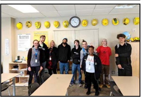
Hilltop Demonstration Project - 6