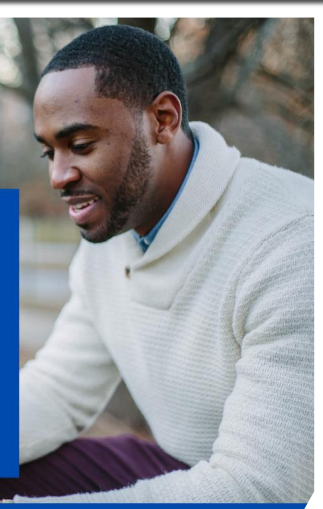
created by thekcgreen.com

Joe and Kamala will create a new public credit reporting agency within the Consumer Financial Protection Bureau to provide consumers with a government option that seeks to minimize racial disparities, for example by ensuring the algorithms used for credit scoring don't have a discriminatory impact, and by accepting non-traditional sources of data like rental history and utility bills to establish credit.