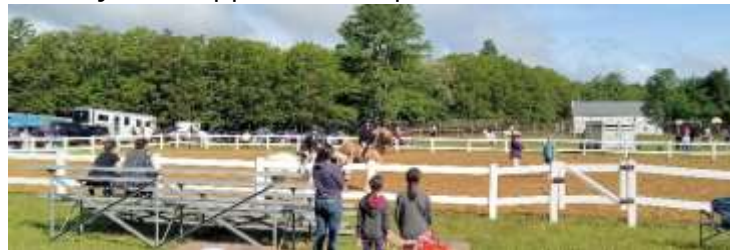
A very busy Ring #2

The late-spring Sunday sun heralded a perfect day for a horse show. The rain of the previous day set the show rings up for a surprisingly mud-free and fairly dust-free day. With nearly 70 riders & drivers and a roughly equal number of spectators, the first show of the 2023 Barre Horse Show Series produced a bustling atmosphere of equine activity. This was a top-notch show in ways both equestrian and administrative. With dozens of horses and people roaming the two rings and surrounding areas, all activities ran smoothly and efficiently. Participants and spectators were treated to the sincere efforts of equestrians both young and old. It was wonderful to see familiar faces as well as meet new friends. With more than 60 classes in 15 divisions, including driving and trail classes, the Barre Show Series offered friendly and supportive competition to all.