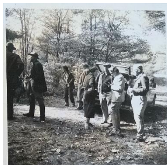
Half Way Point Trail Ride Oct 56