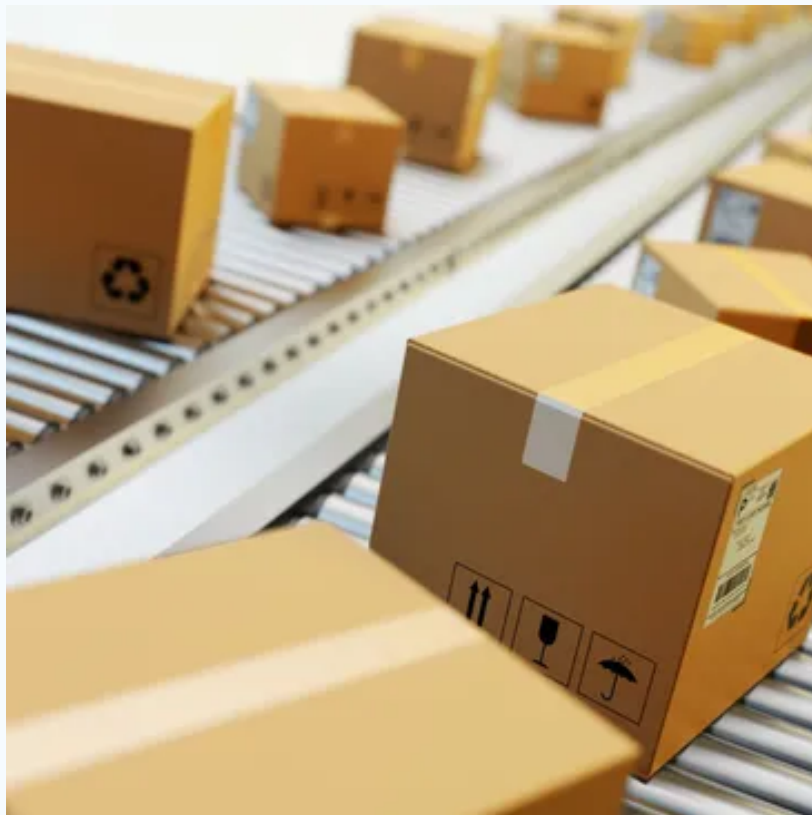
SUPPLY CHAIN & LOGISTICS