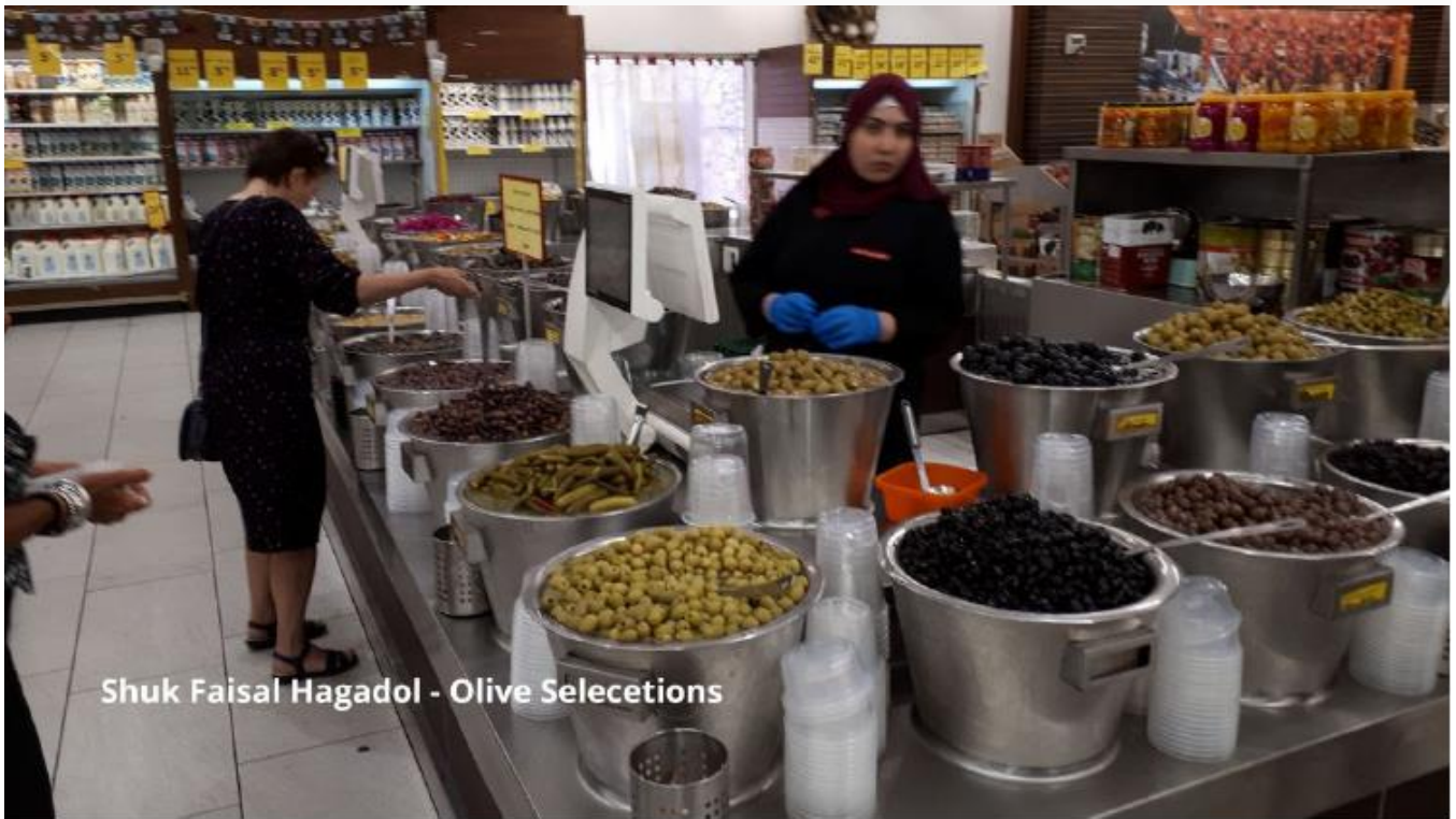
Shuk Faisal Hagadol - Olive Selections