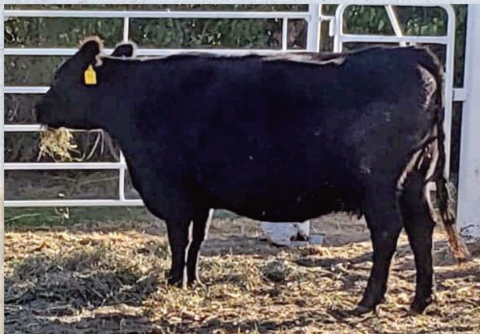
Our donor cow E D Erica 910 at 12 years of age

We're grateful to these financial sponsors who helped make our tour participation a reality. Sandhills State Bank • JC Ranch Designs • Sheridan Livestock Auction • Bolek Bilt Welding and Fabrication Sheridan County Farm Bureau (Bassegio Agency) • Dyer Feed Inc • Hyannis Vet Service Bull Barn Genetics and Cedar Top Ranch.