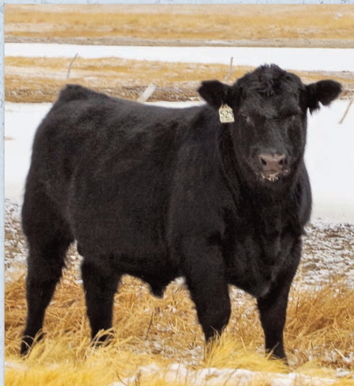
LOT 529 - E D SEEDSTOCK 159