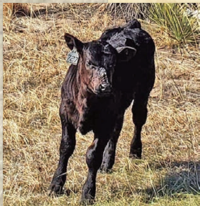
Lot 727 in April, 2021