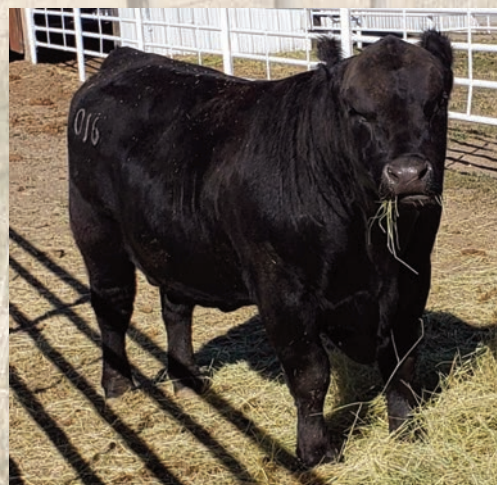
Our newest herd bull J D Ashland 016 at Western Sire Services tour stop