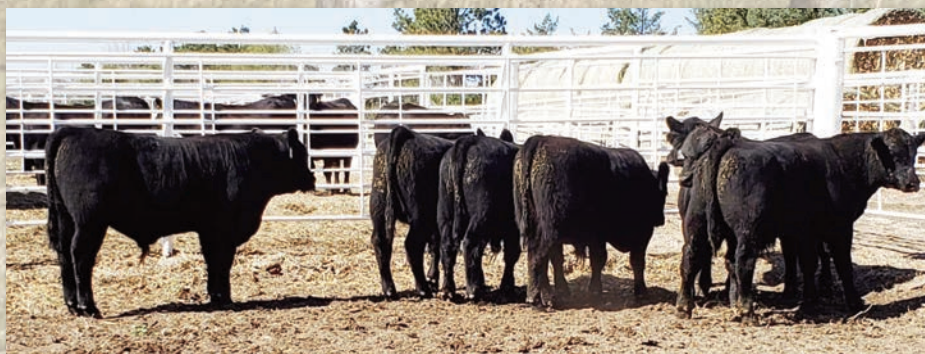
Weaned bull calves on display