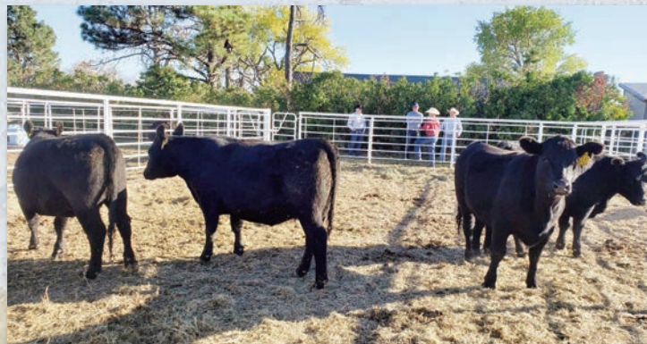
Bred replacement heifers, daughters of our donor cow E D Erica 910