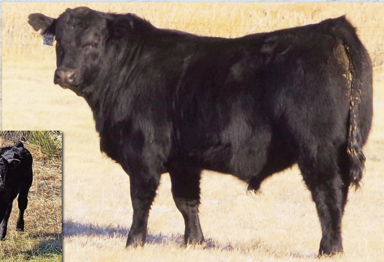
LOT 727 • E D SEEDSTOCK 177