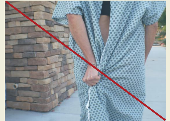
Not a Good Look for Your Bottom Line