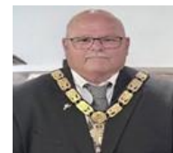
5 YEAR TRUSTEE