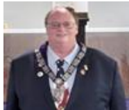
2 YEAR TRUSTEE