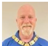
3 YEAR TRUSTEE