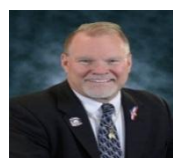
4 YEAR TRUSTEE