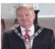
1 YEAR TRUSTEE