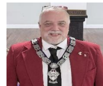
5 YEAR TRUSTEE