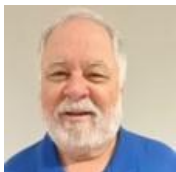
1 YEAR TRUSTEE