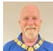
4 YEAR TRUSTEE