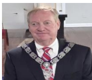
2 YEAR TRUSTEE