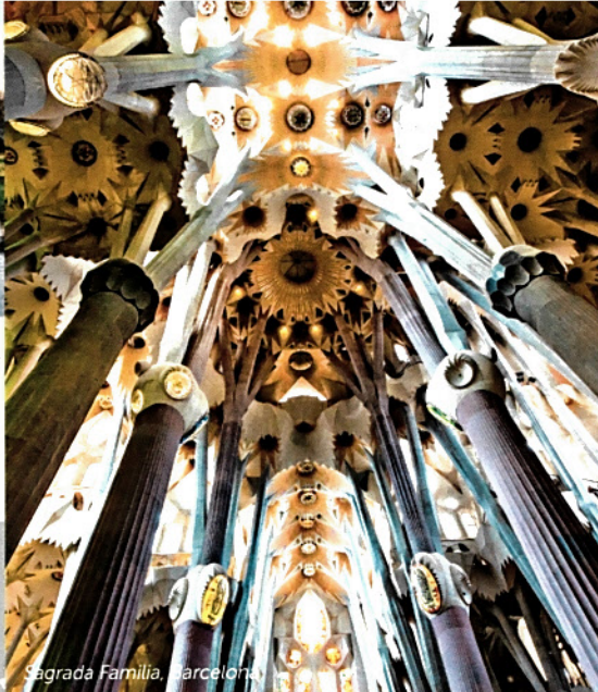
Sagrada Família, Barcelona