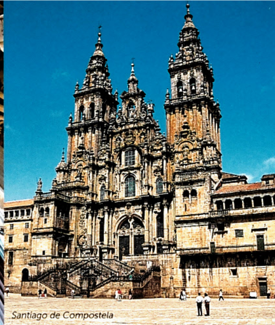
Santiago de Compostela