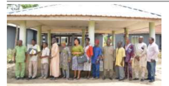
Share the journey with members of the Umuechem community in Nigeria

COME OUT AND ENJOY AN ENTICING INTERNATIONAL POT-LUCK, DOOR PRIZES, GAMES, CONTESTS, GREAT MUSIC, DANCING