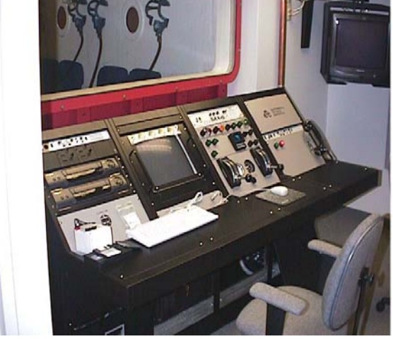
(Control Console with manual and computer controls)