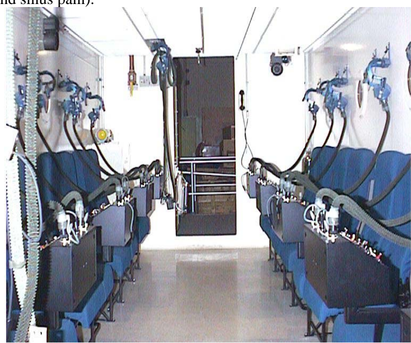
(CAMIs new altitude chamber delivered in 1998. The only chamber to date that meets the P.V.H.O. standards)