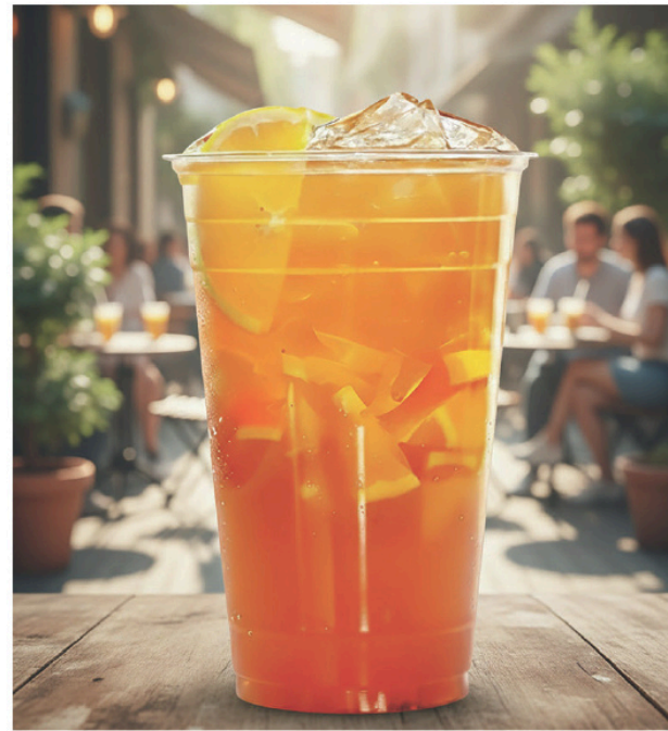
Orange Fruit Tea 5.80