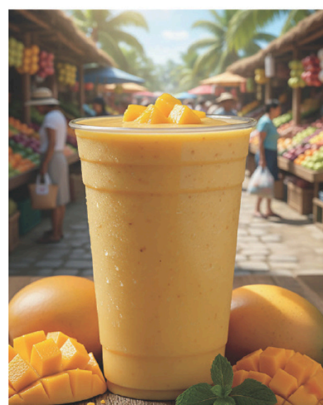
Mango Smoothie 6.25