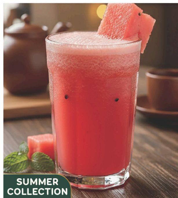
Watermelon Juice 5.80