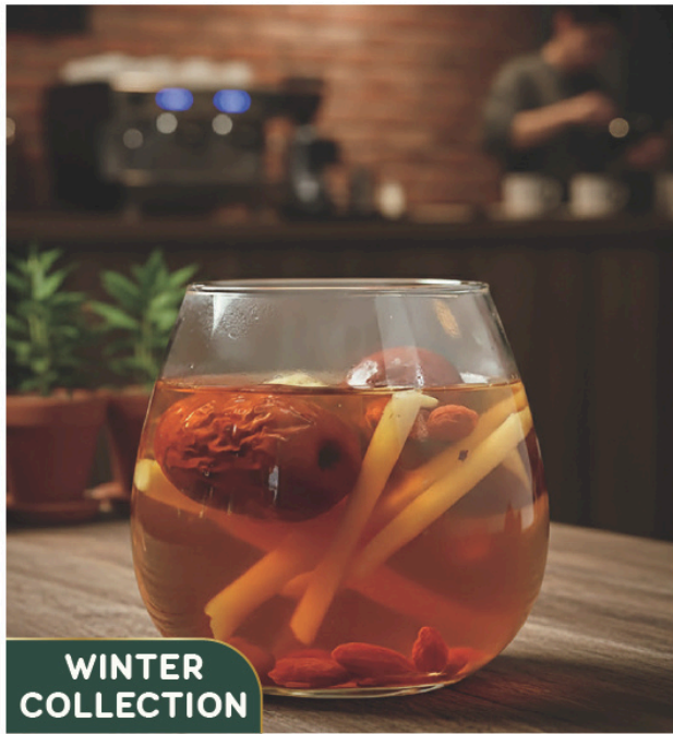
Ginger Herbal Tea 4.20