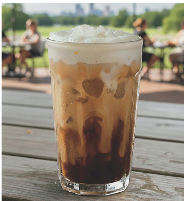
Seasalt Coffee | 6.25 Iced / Hot