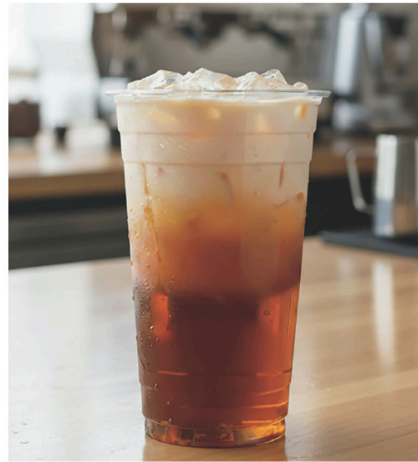
Thai Tea 5.80