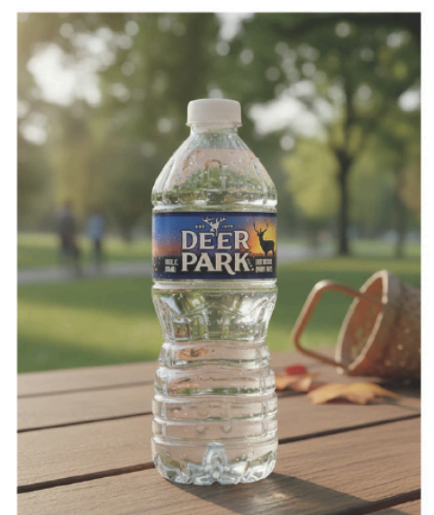
Bottled Water 1.50