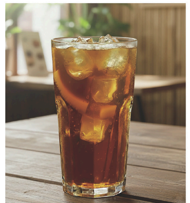
Sweet Iced Tea | 3.80 Wintermelon Tea | 3.80