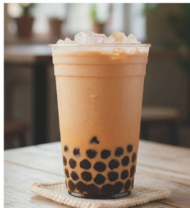
Boba Milk Tea 6.25