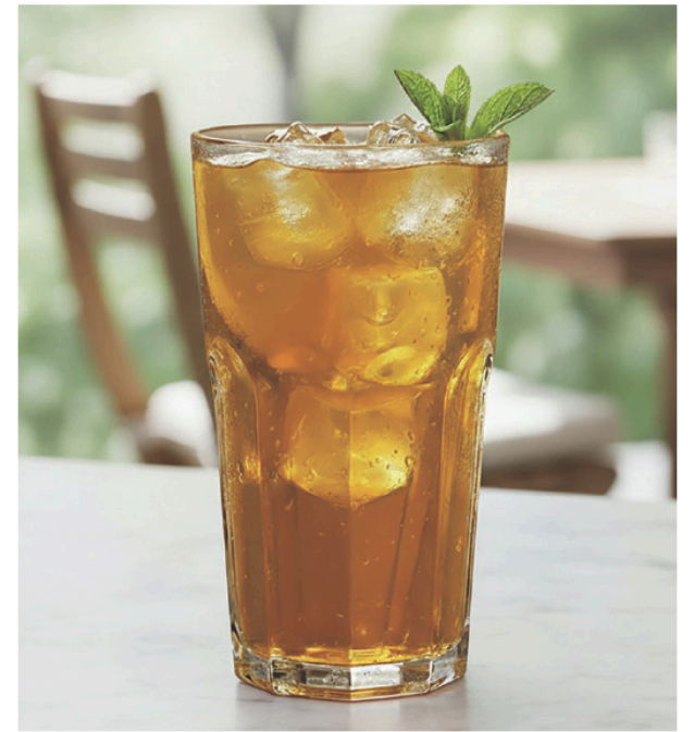
Unsweetend Tea 2.80