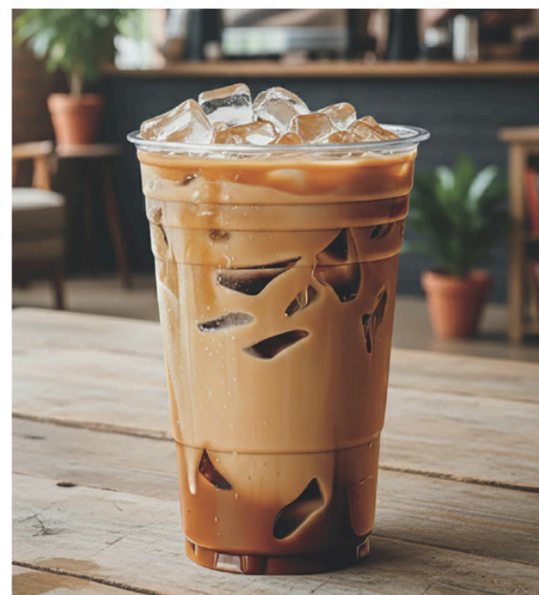
Vietnamese Coffee | 6.25 Iced / Hot