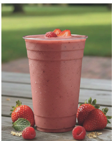
Strawberry & Banana Smoothie | 6.25