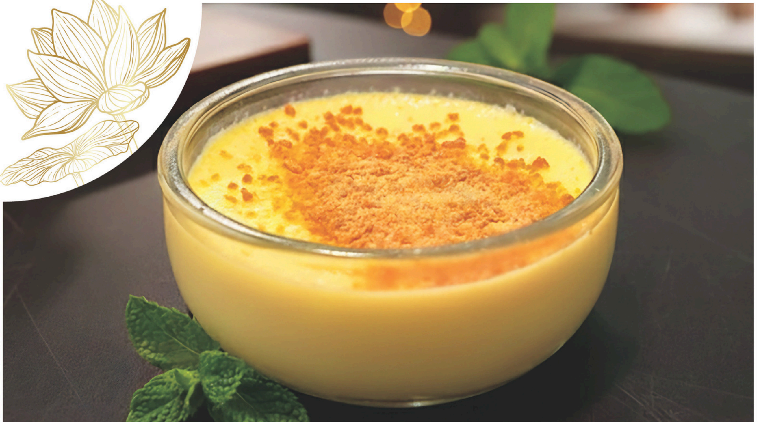
CRÈME BRÛLÉE | 4.20