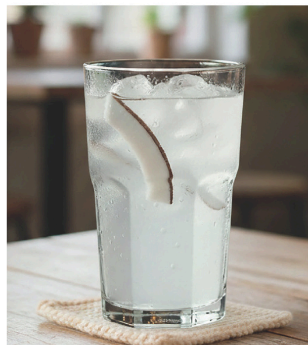
Coconut Water Juice 4.20