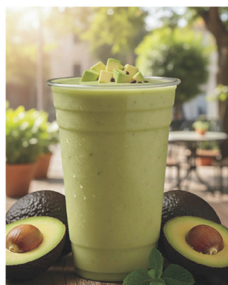
Avocado Smoothie 6.25