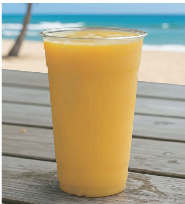
Mango Juice 4.20