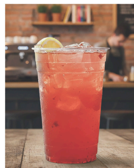
Strawberry Lemonade 5.80