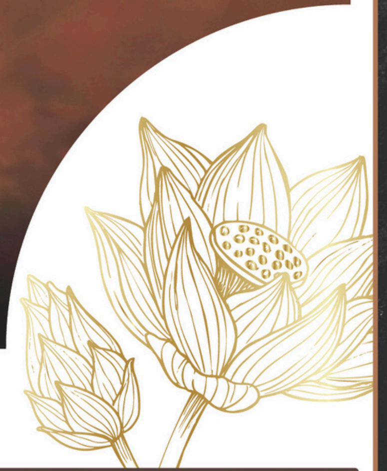
TIRAMISU | 4.20