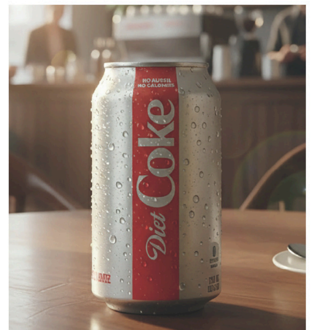
Soda Can 2.50