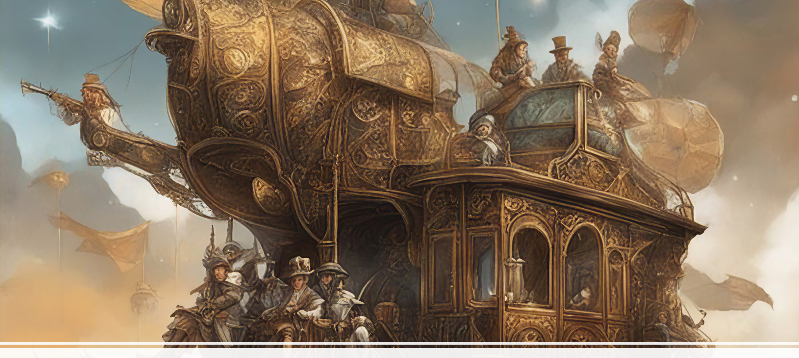
Sample Krewe Puzzle