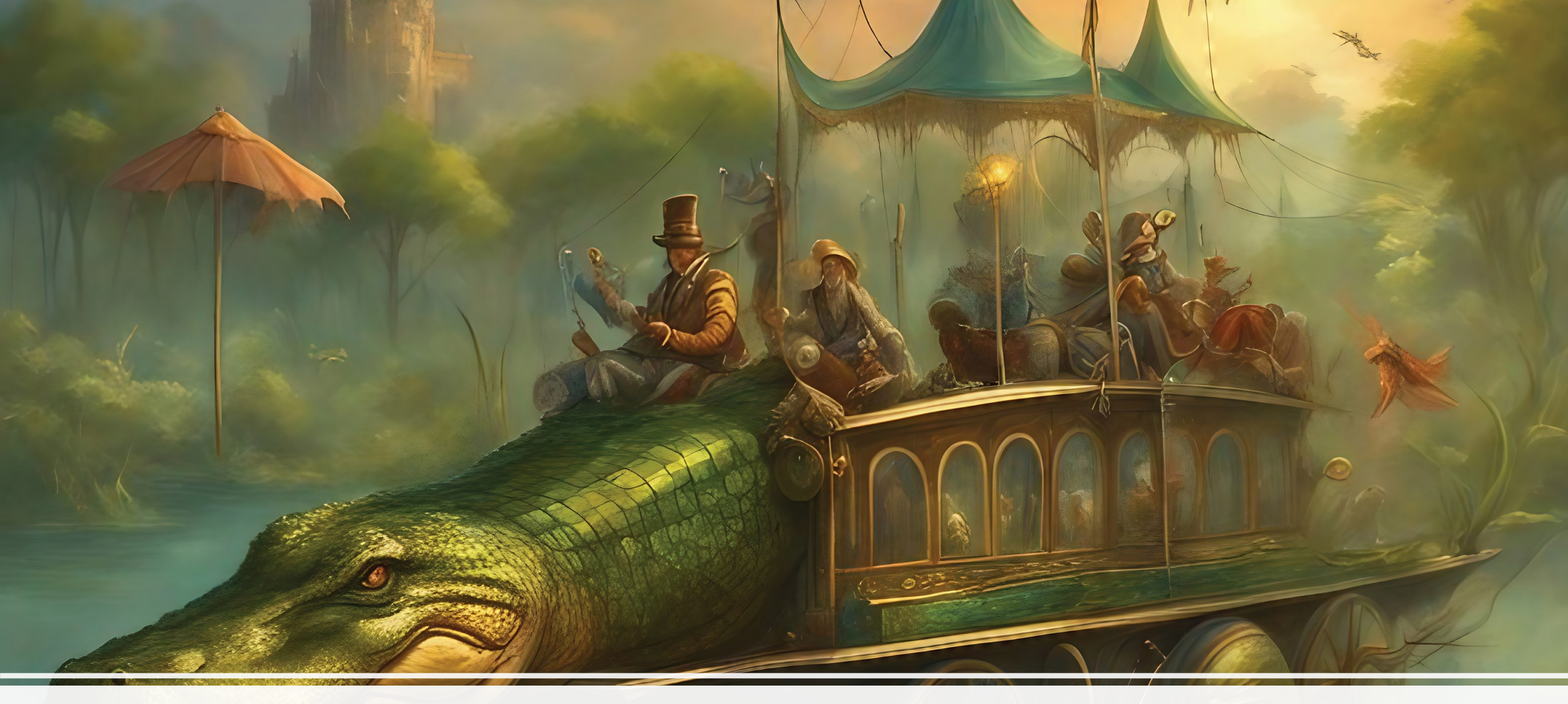
Sample Krewe Puzzle