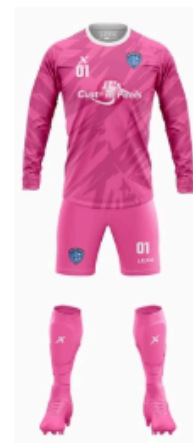
NORTH PORT FUSION - Goalkeeper player package - Long Sleeve $188.00

STEP 3 • Input your player's sizing, assigned uniform number (Contact Coach or Manager if unsure) and Display Name (Last name or Nickname). All fields need to be completed before the package can be added to your cart.