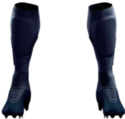
NORTH PORT FUSION AWAYFULL KIT