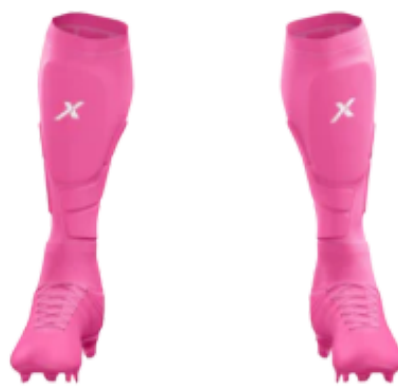
NORTH PORT FUSION HOME FULL KIT