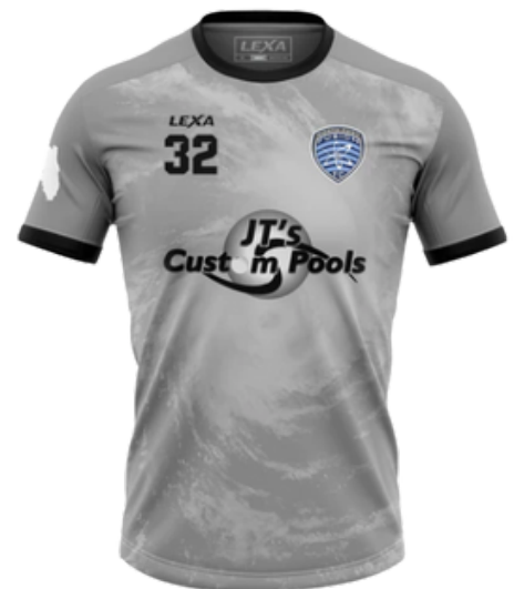
NORTH PORT FUSION PRACTICE TOP 2X