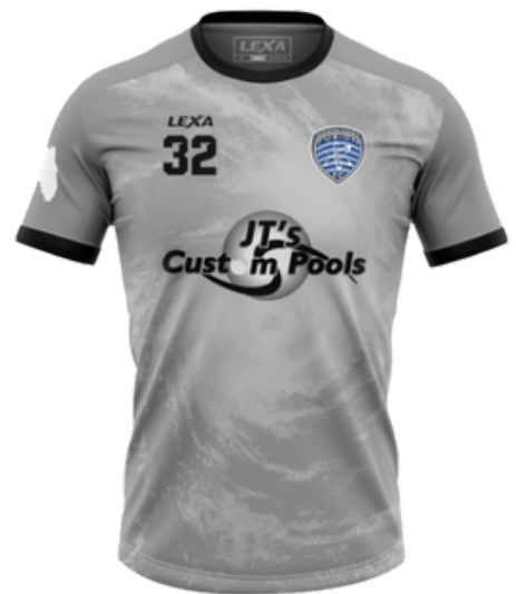
NORTH PORT FUSION PRACTICE TOP 2X