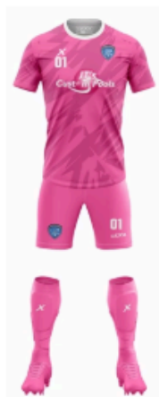
NORTH PORT FUSION - Goalkeeper player package - Short Sleeve $188.00