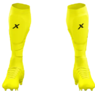
NORTH PORT FUSION AWAY FULL KIT