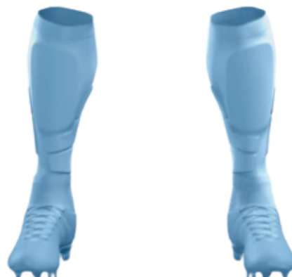
NORTH PORT FUSION HOME FULL KIT