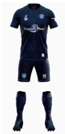
NORTH PORT FUSION - Field player kit - Short sleeve $188.00