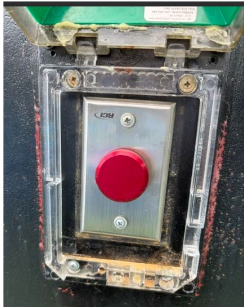
Ants overtook the exit button