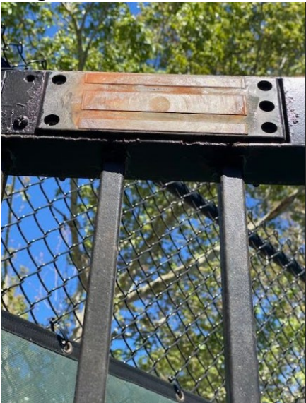
Magnet on court frame