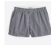
Undergarments or Sports Bras