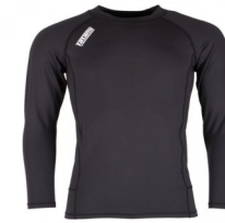
Rash guard (long or short