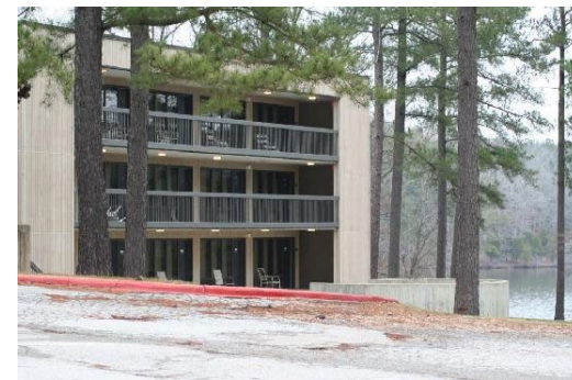
Lodge at Natchez Trace State Park